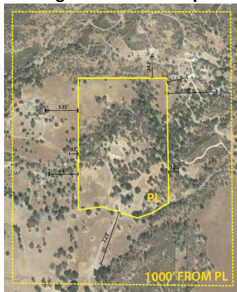
Figure 6: Buffer Map

The proposed site is NOT within 1,000 linear feet of any sensitive uses (refer to the buffer map included below). The proposed site is more than 390 linear feet from any adjacent off-site residence. The proposed site is secluded and well-hidden. The outdoor Cannabis Cultivation sites have been specifically located to be out of public and private views with the intent of minimizing potential attention from San Luis Obispo County citizens. Very little recognition of the site is expected.