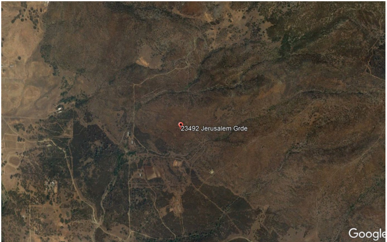
Aerial Photo of Site and Immediate Vicinity