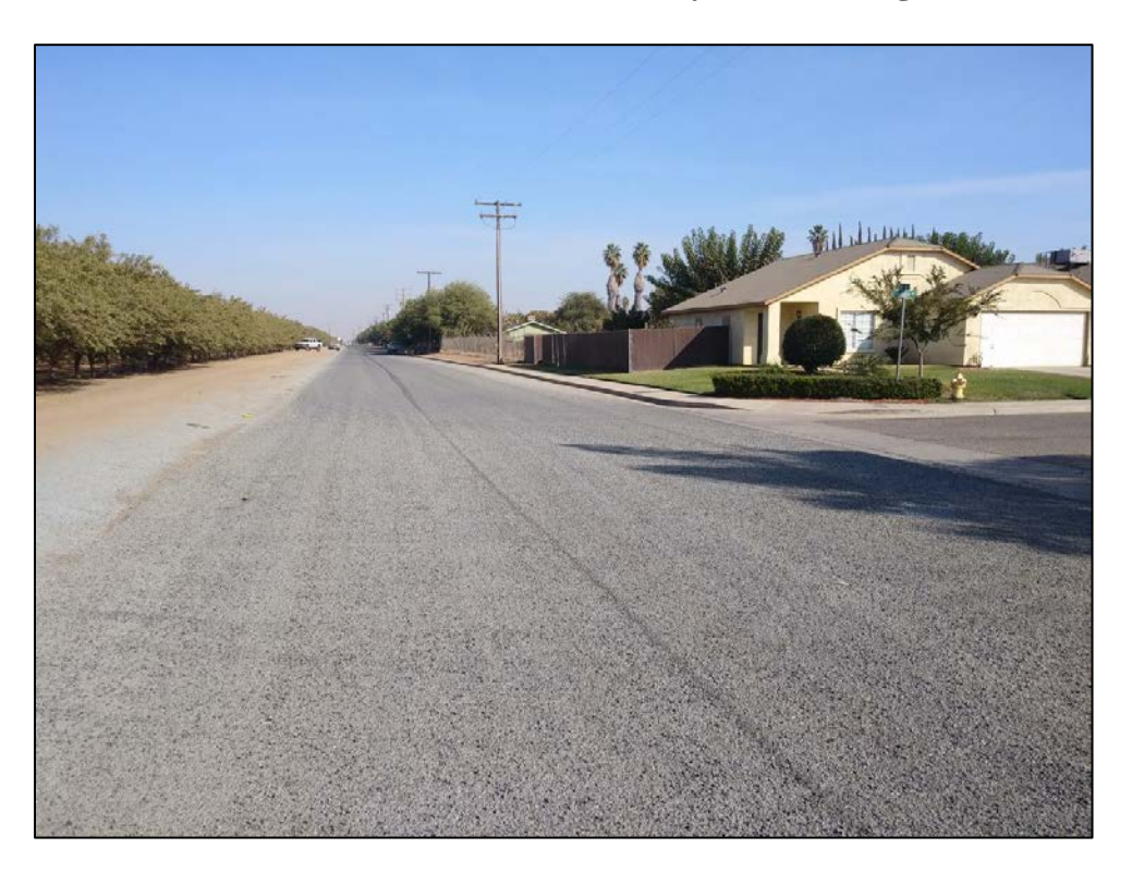
Figure 3. Overview of the proposed pipeline corridor along Road 164, looking north.

Figure 2. Overview of the proposed pipeline corridor along Woodville Road, looking south. Note - Woodville View Elementary School on right.