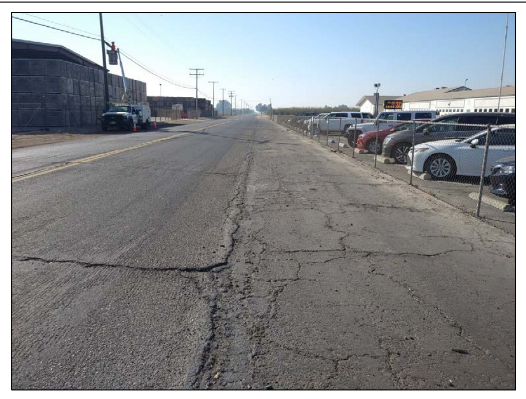
Figure 2. Overview of the proposed pipeline corridor along Woodville Road, looking south. Note - Woodville View Elementary School on right.