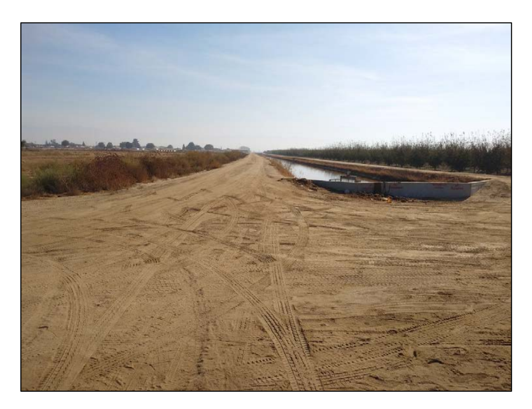
Figure 4. Overview of proposed pipe corridor along dirt road right-of-way between Road 164 and Woodville Road, looking east.