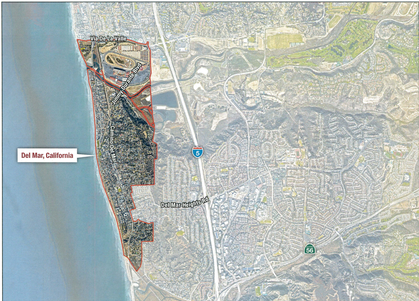
EXHIBIT 2: City Map 6 th Cycle Housing Element Update and EIR