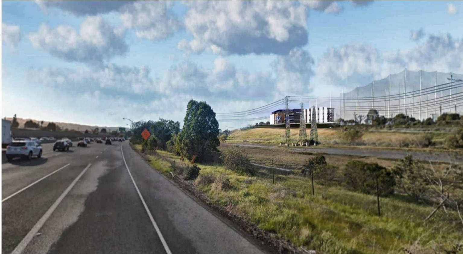
CONCEPTUAL RENDERING PERSPECTIVE VIEW WITH VIEWING DECK