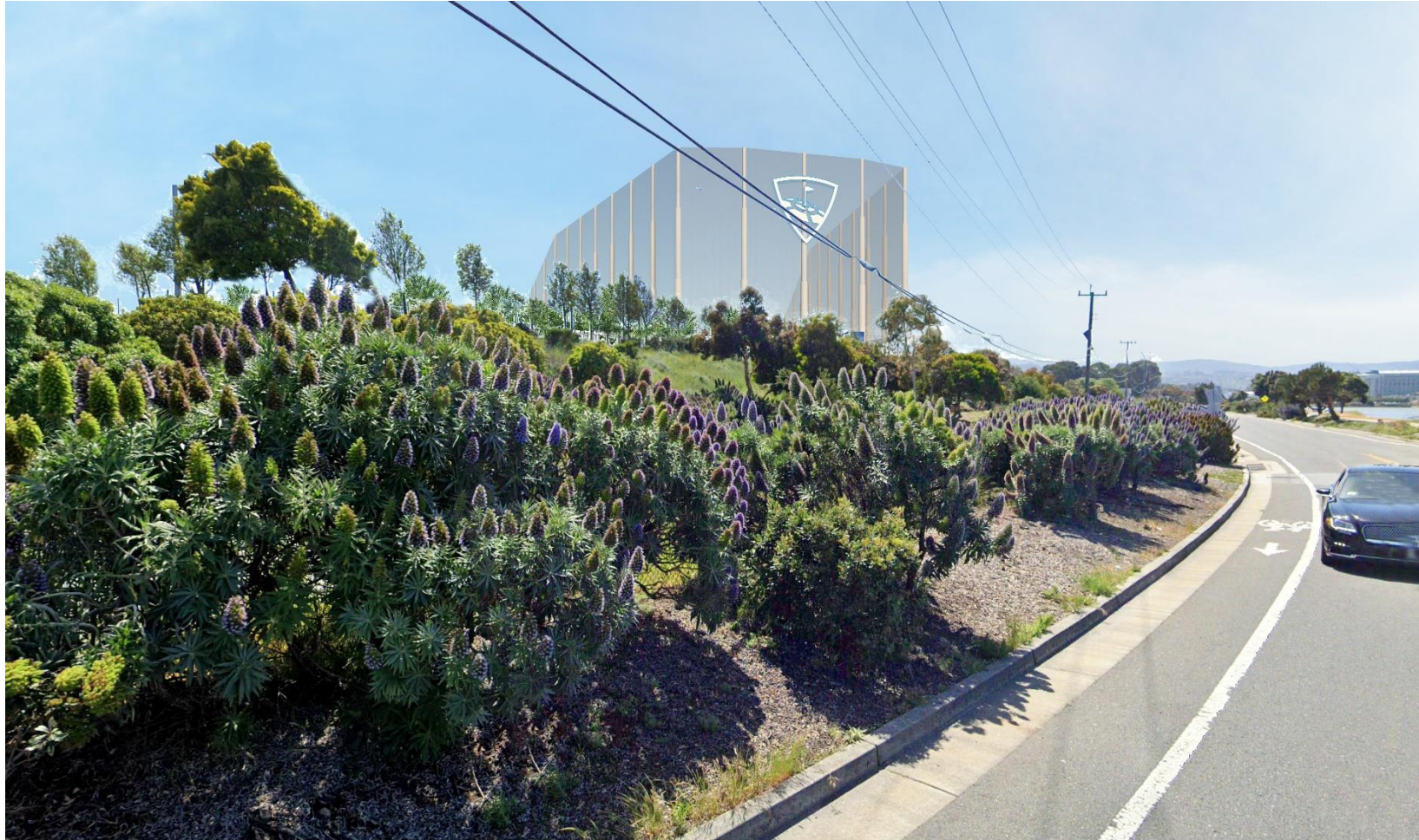
View-05A Airport Blvd Northbound 08.02.2019 Draft 1 TOPGOLF BURLINGAME, CA.