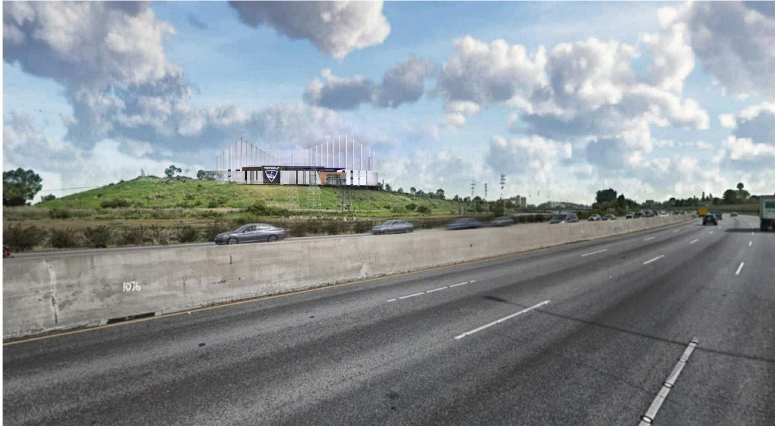
CONCEPTUAL RENDERING PERSPECTIVE VIEW WITH VIEWING DECK