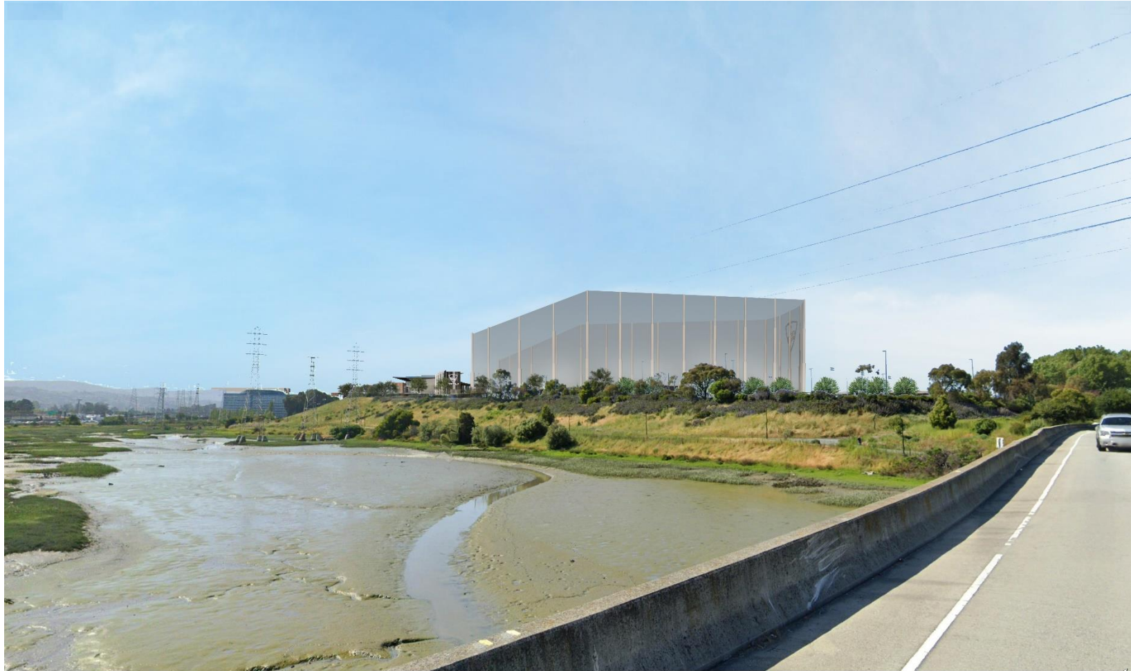
View-04 Anza Blvd