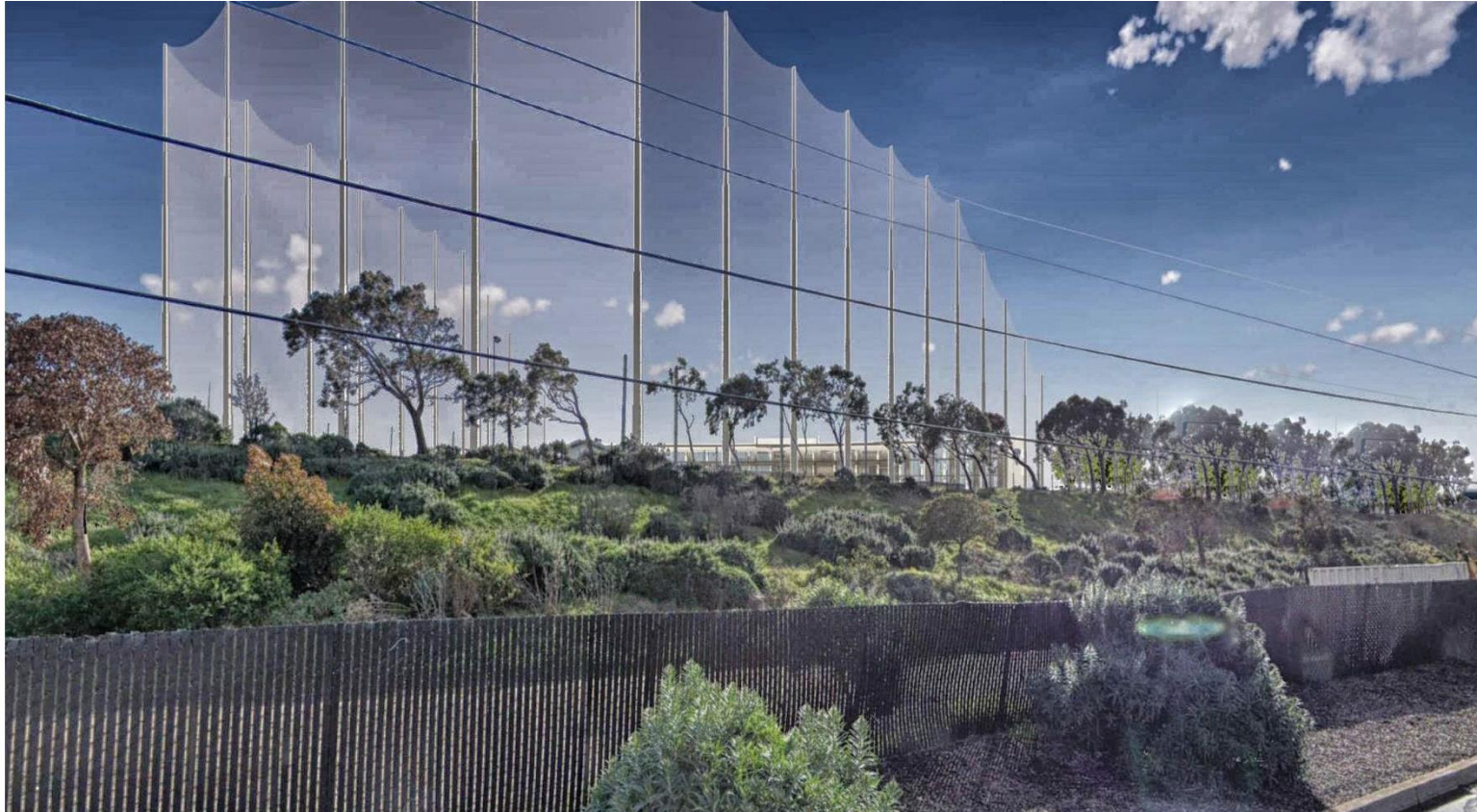
CONCEPTUAL RENDERING PERSPECTIVE VIEW