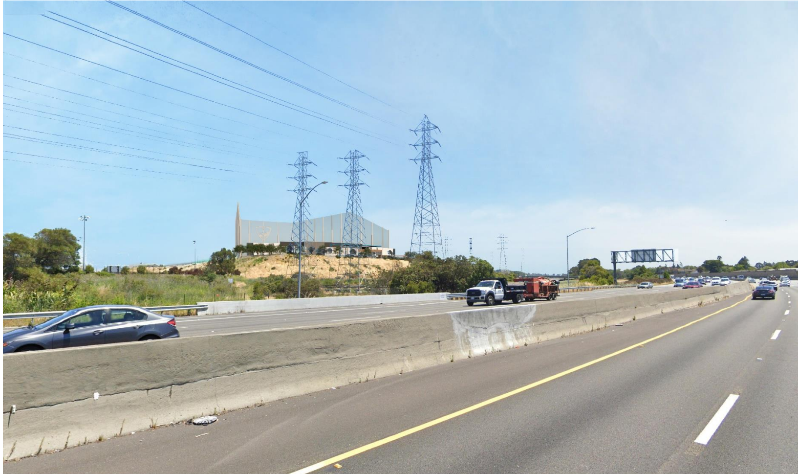
View-03 101 Southbound