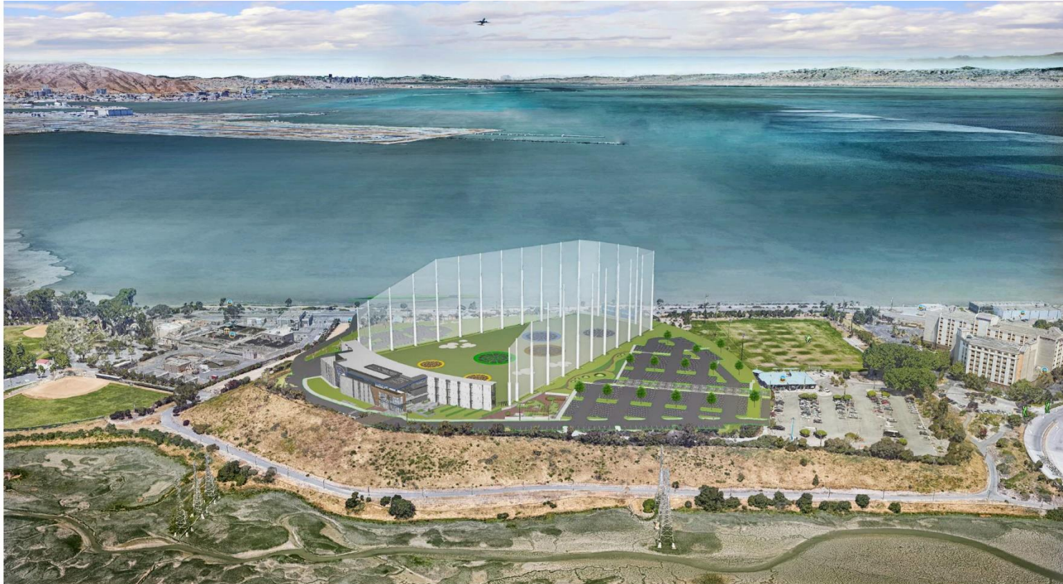
CONCEPTUAL RENDERING AERIAL VIEW