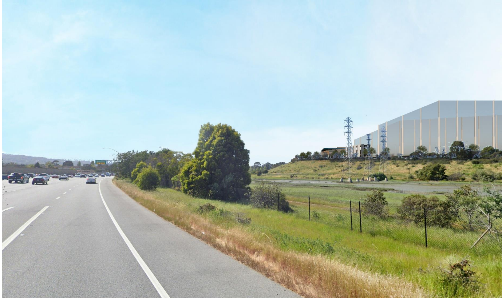
View-01B 101 Northbound