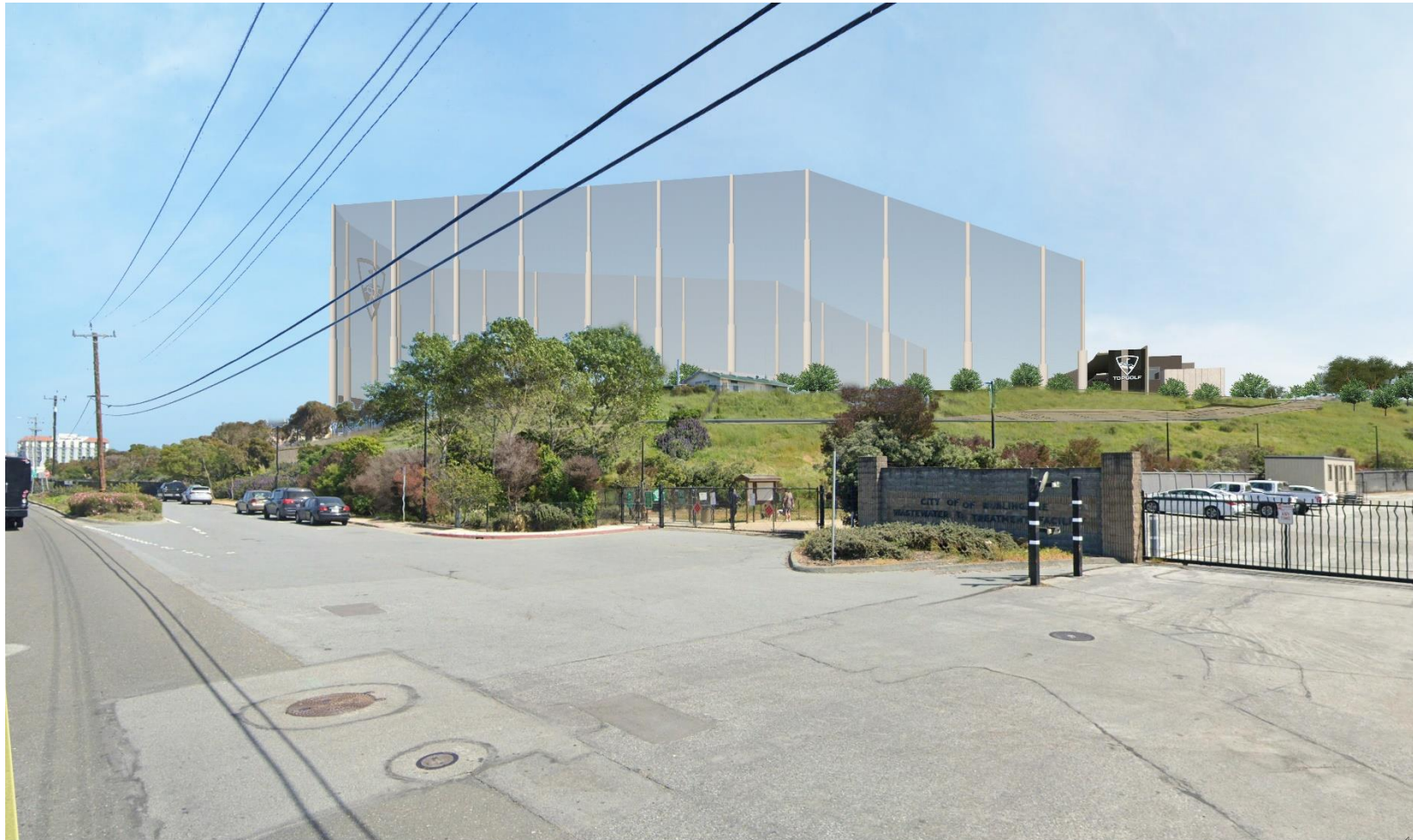
View-06 Airport Blvd Southbound 08.02.2019 Draft 1 TOPGOLF BURLINGAME, CA.