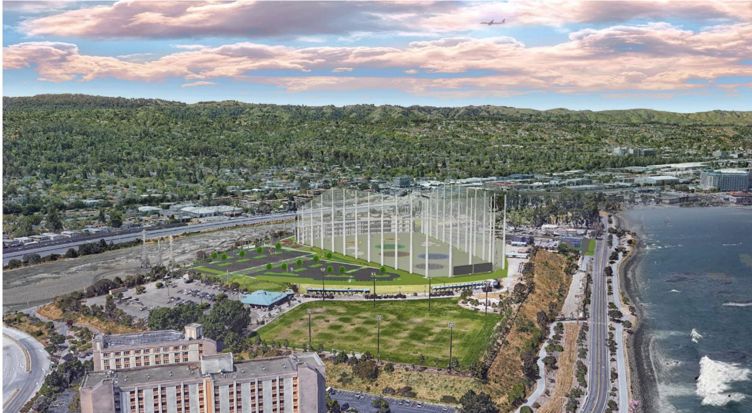
CONCEPTUAL RENDERING AERIAL VIEW