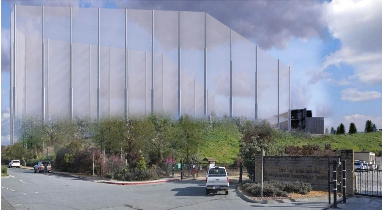
CONCEPTUAL RENDERING PERSPECTIVE VIEW