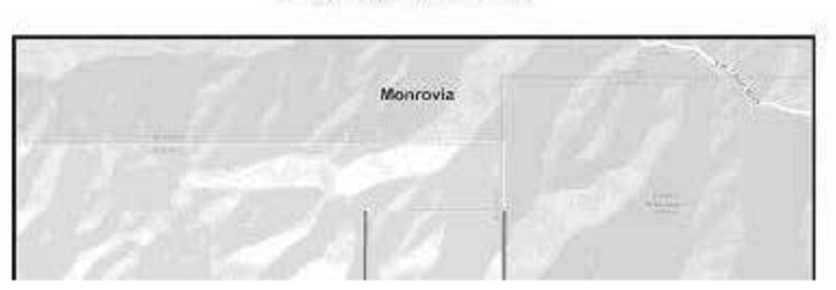
Figure A PROJECT LOCATION

Bradbury City Hall 600 Winston Avenue Bradbury, CA 91008