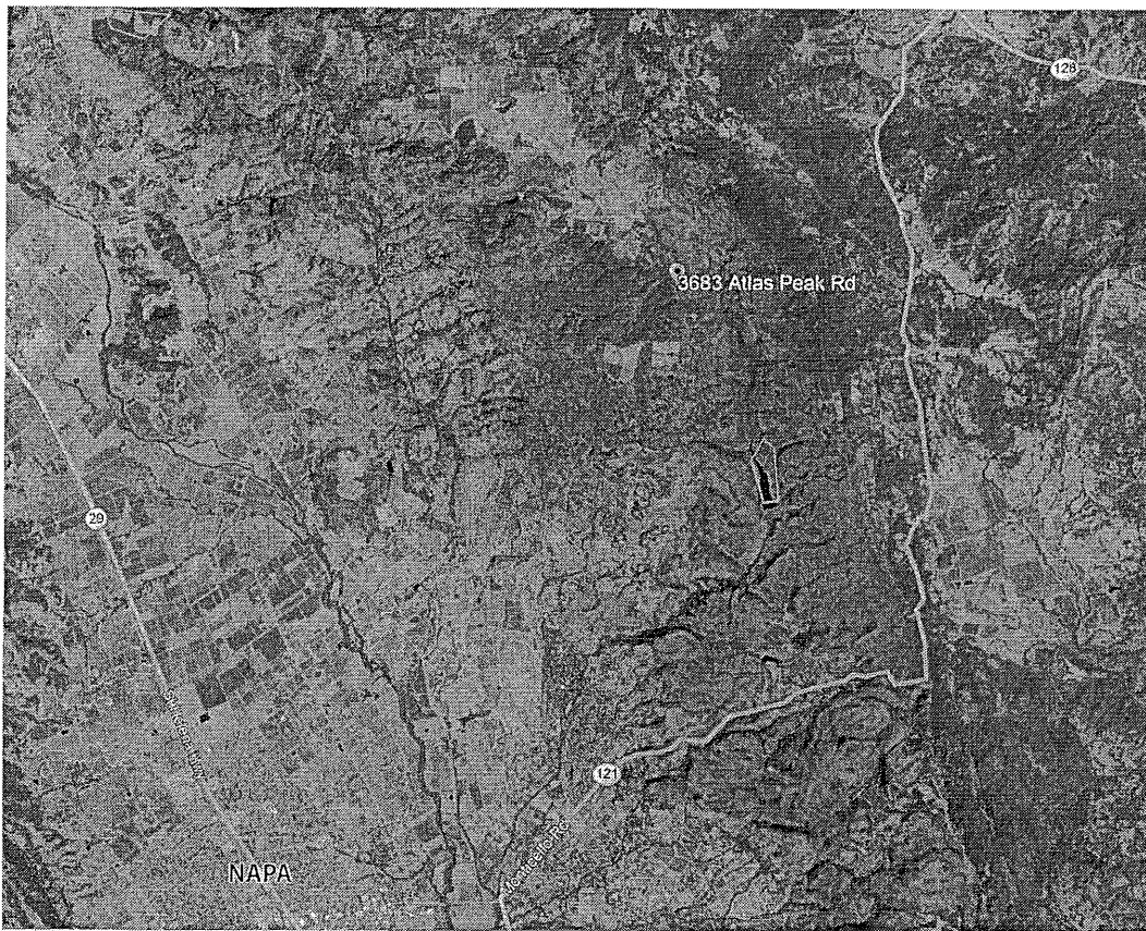
Location of replacement of exclusionary fence project