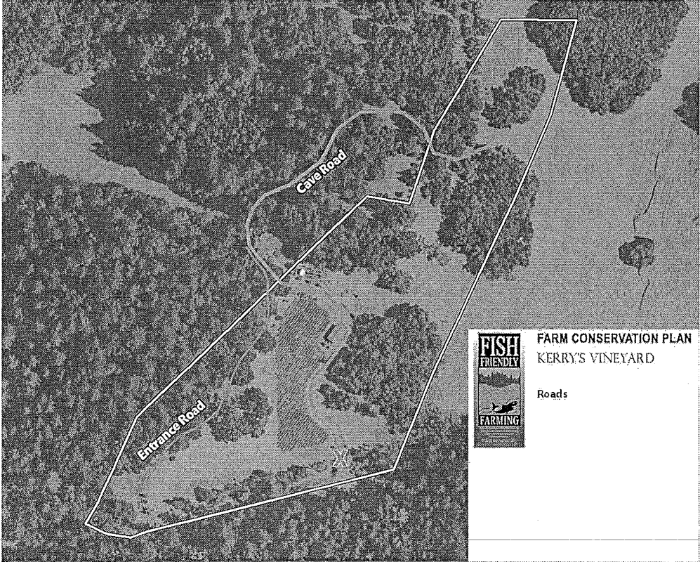
Location of culvert replacement project.