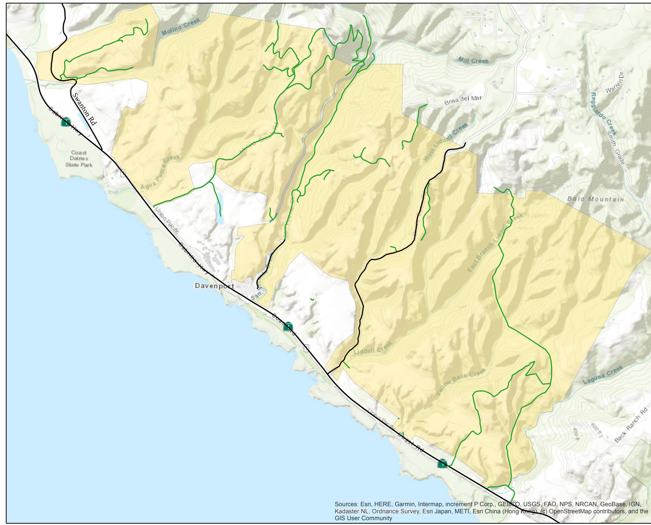
Figure 4: Cotoni-Coast Dairies Administrative Routes and Transportation