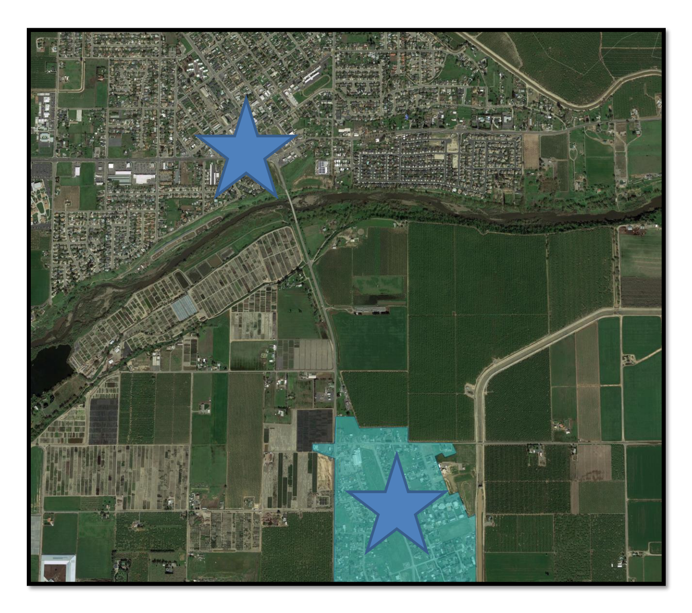
Figure 1 – Regional Location