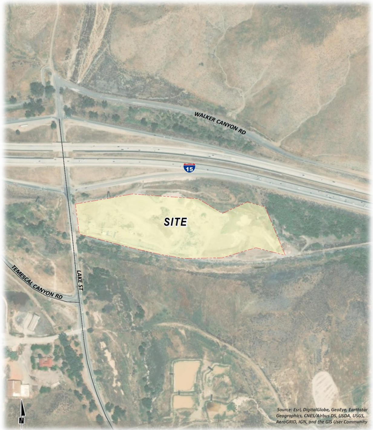
EXHIBIT 1-A: LOCATION MAP