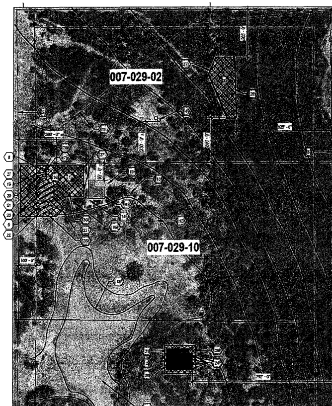
Partial Site Plan showing Cultivation Areas

East: "RL" Rural Lands, sparsely populated with dwellings.