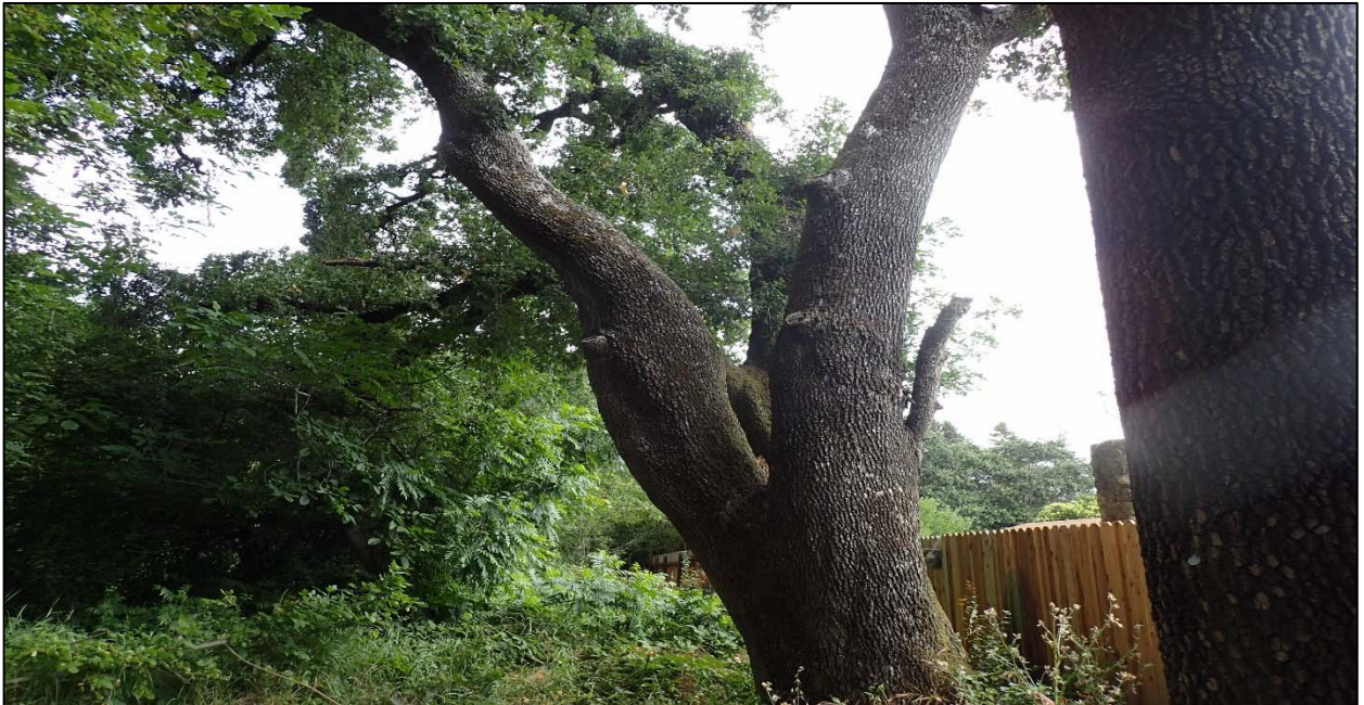
Tree # 113. 61.5" DBH valley oak( Quercus lobata ) in the southeastern portion of the Study Area.