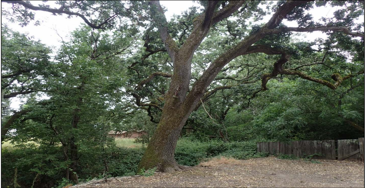
Tree #3. 43.0" DBH valley oak( Quercus lobata ) in the southern portion of the Study Area adjacent to Roseland Creek.