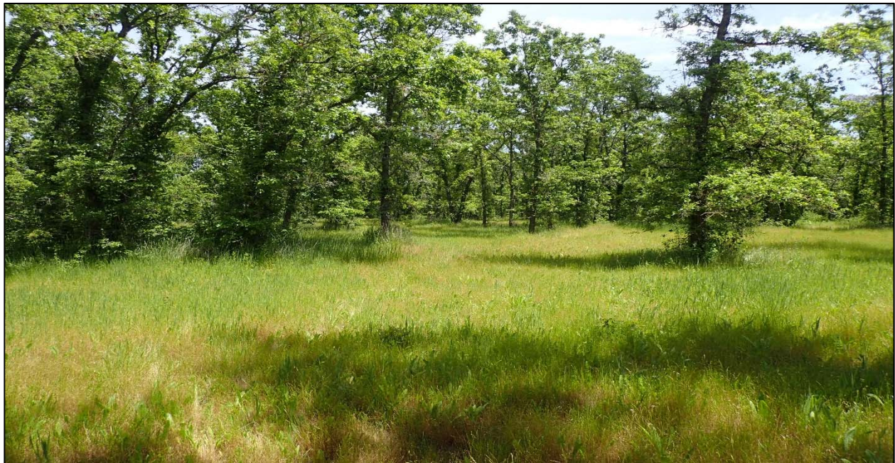
Representative photo of tree spacing in northern portion of the Study Area.