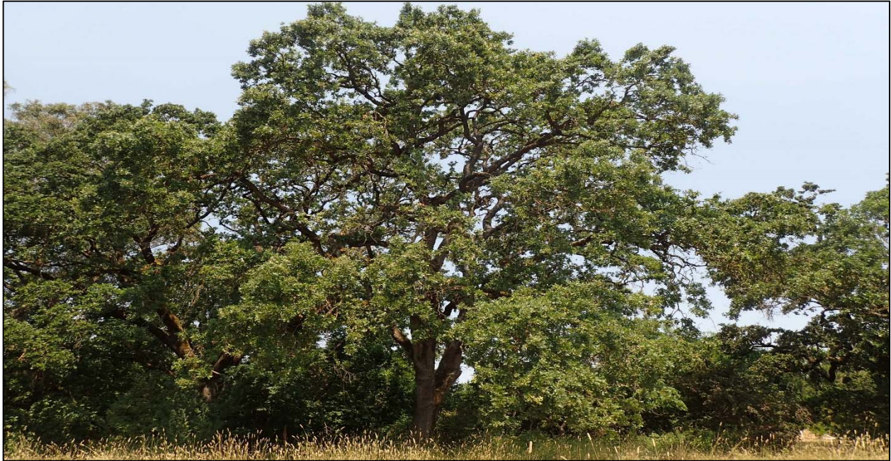
Tree #47. 39.0" DBH valley oak( Quercus lobata ) in the southern portion of the Study Area.