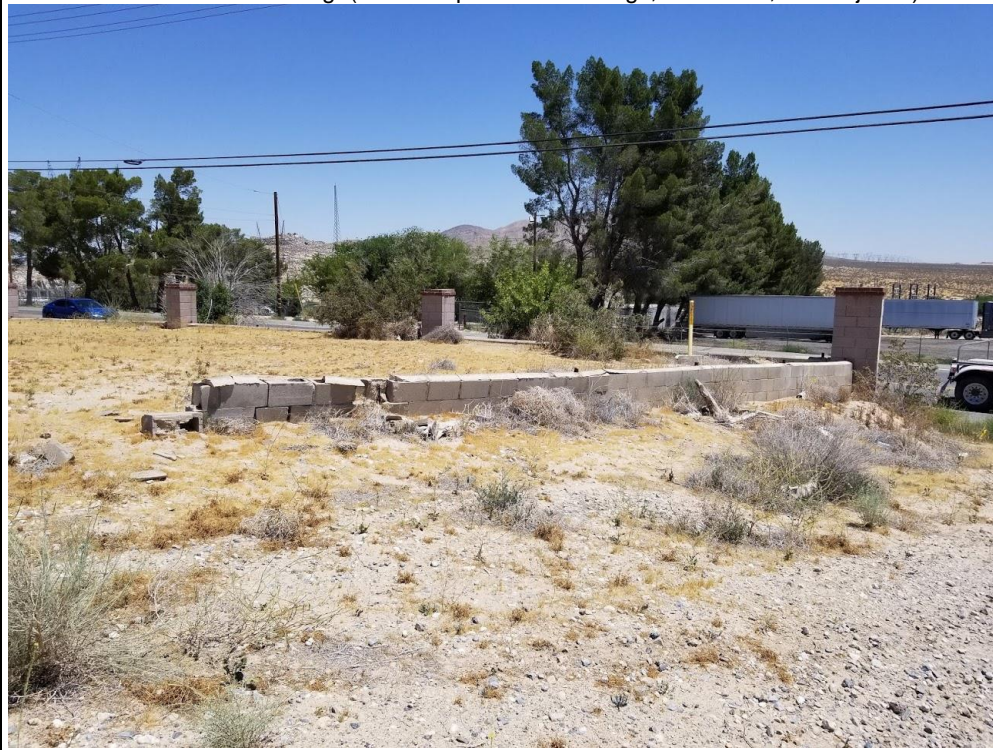
P5a. Photo or Drawing (Photo required for buildings, structures, and objects.)

P5b. Description of Photo: (View, date, accession #) North, 5/14/19, Photo 2