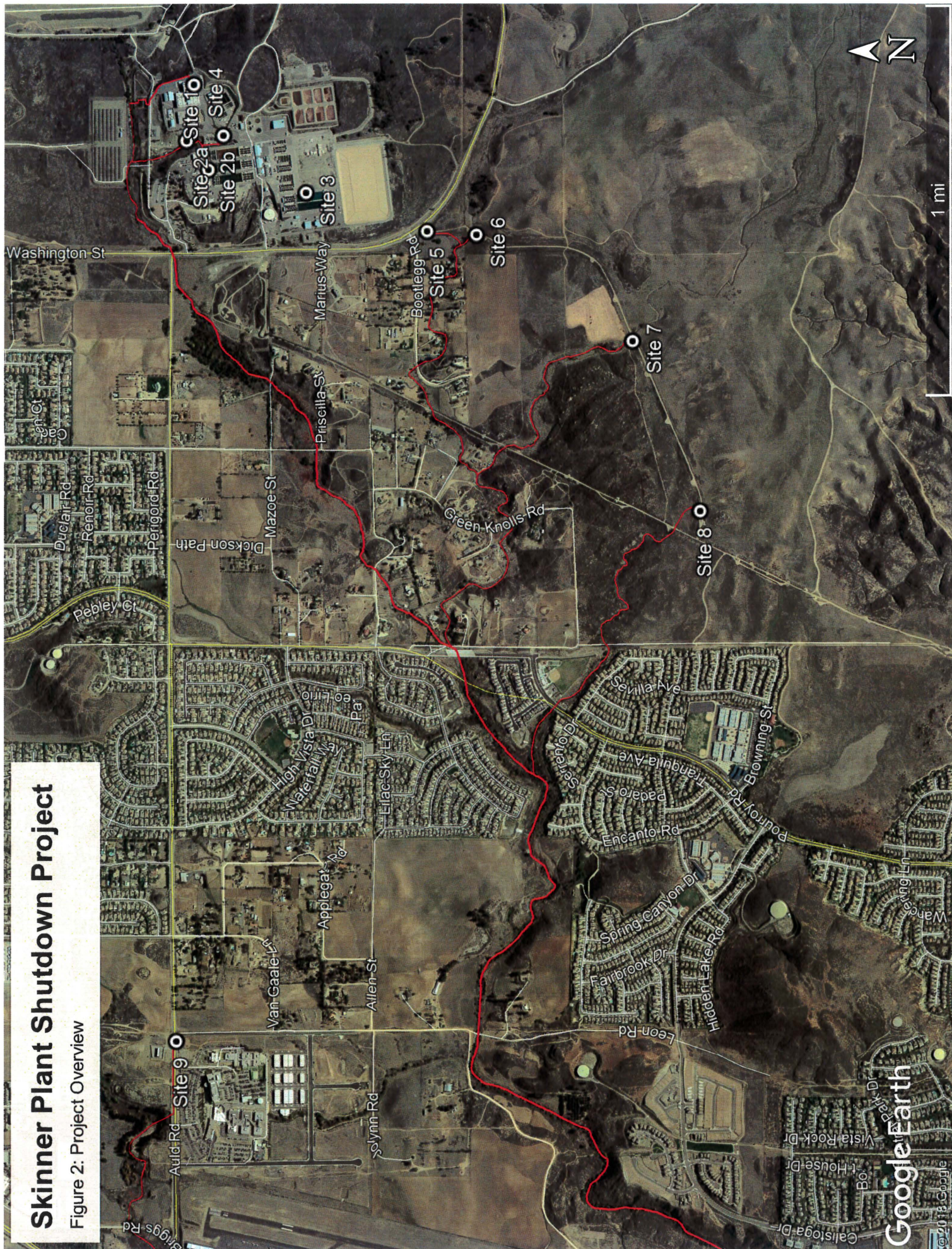
Figure 2: Project Overview