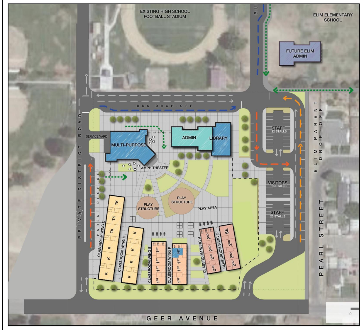
Figure 3. Project Site Plan