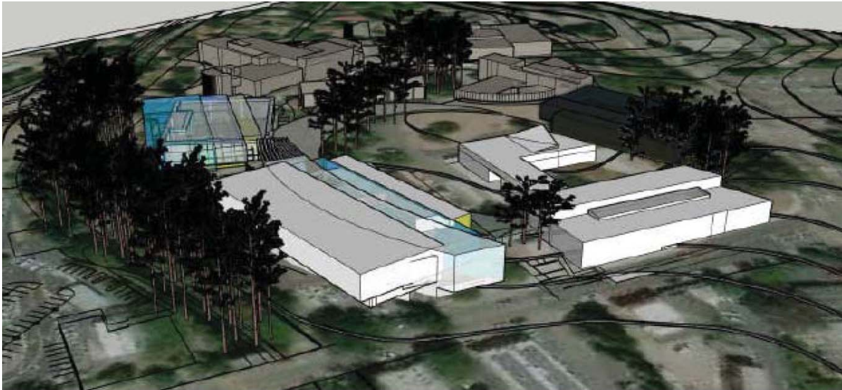
Caption: Proposed Learning and Resources Center.