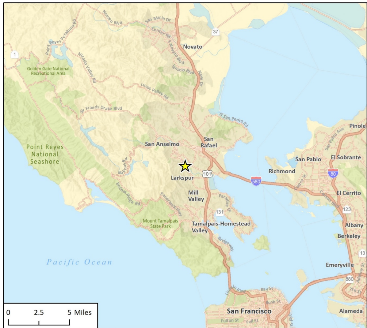
Figure 1 Regional Location