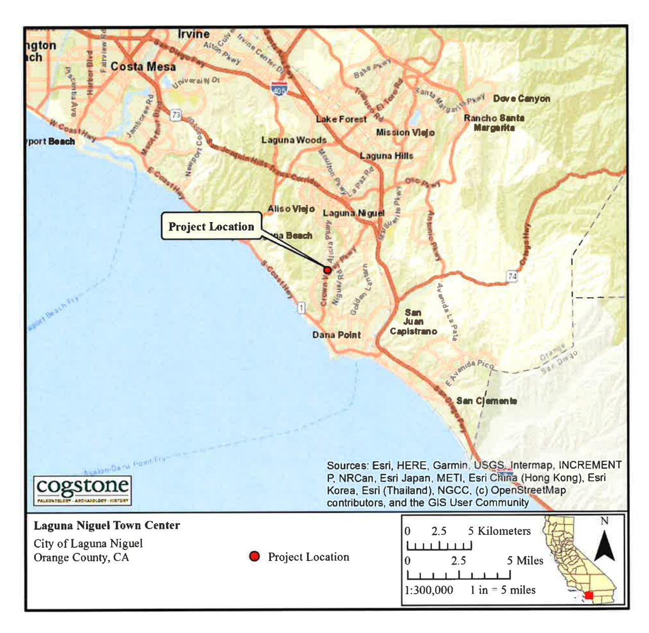
Figure 1. Project Vicinity Map