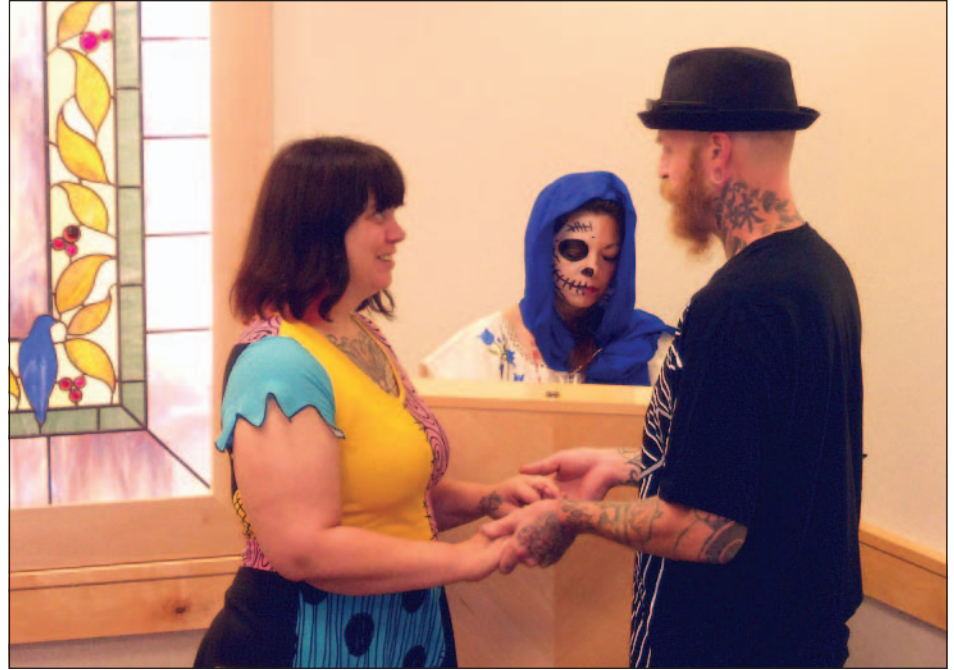
A Contra Costa County deputy commissioner in a Day of the Dead costume officiates at a past Halloween wedding in the County Clerk-Recorder's Office in Martinez.