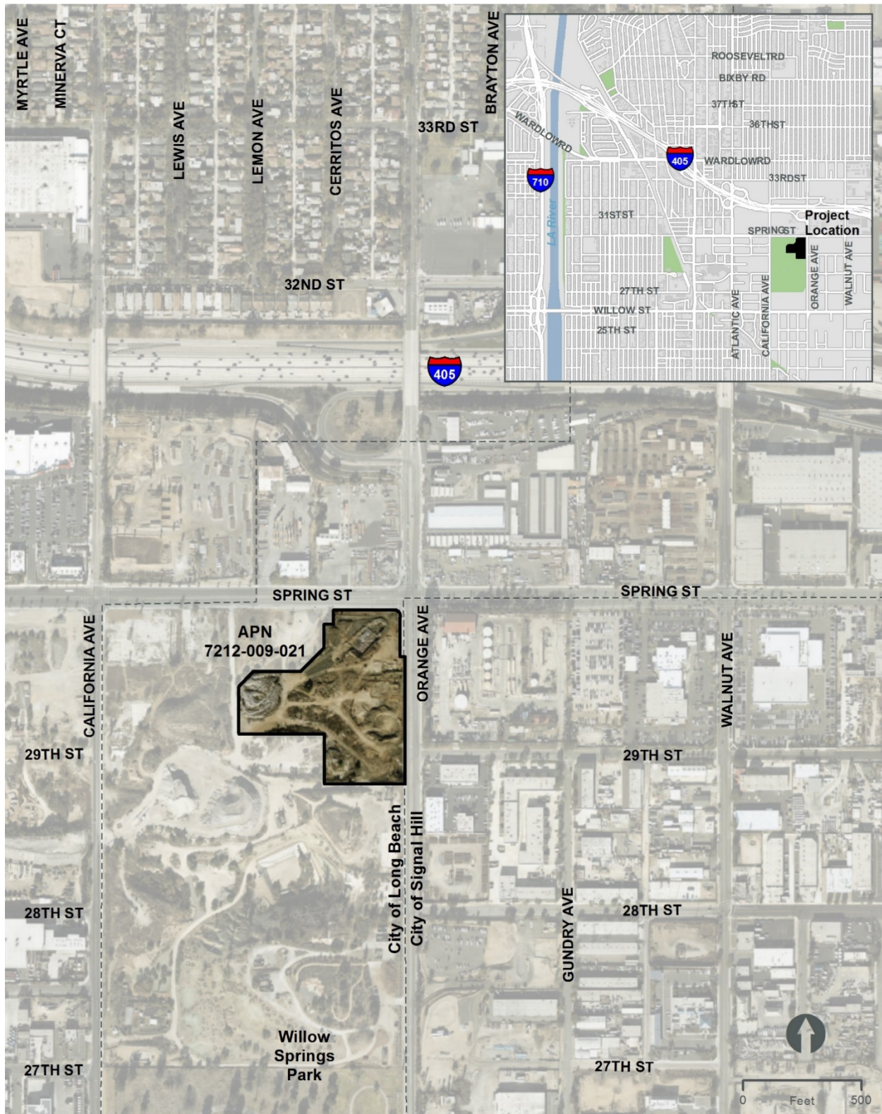
Figure 1. Regional Vicinity and Project Location