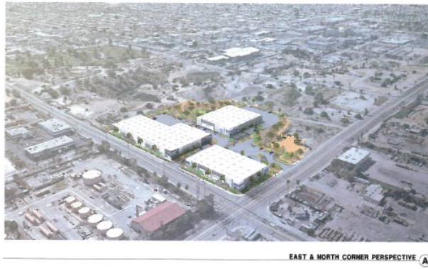
Figure 3. Visual Simulations – Project Site