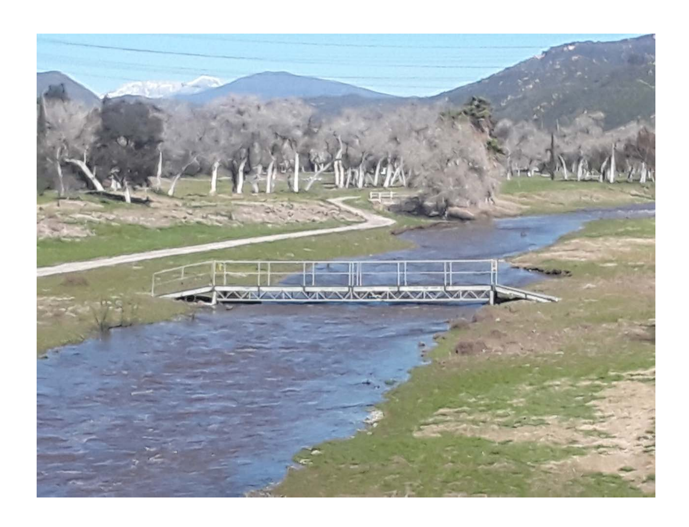
Sent from Yahoo Mail on Android