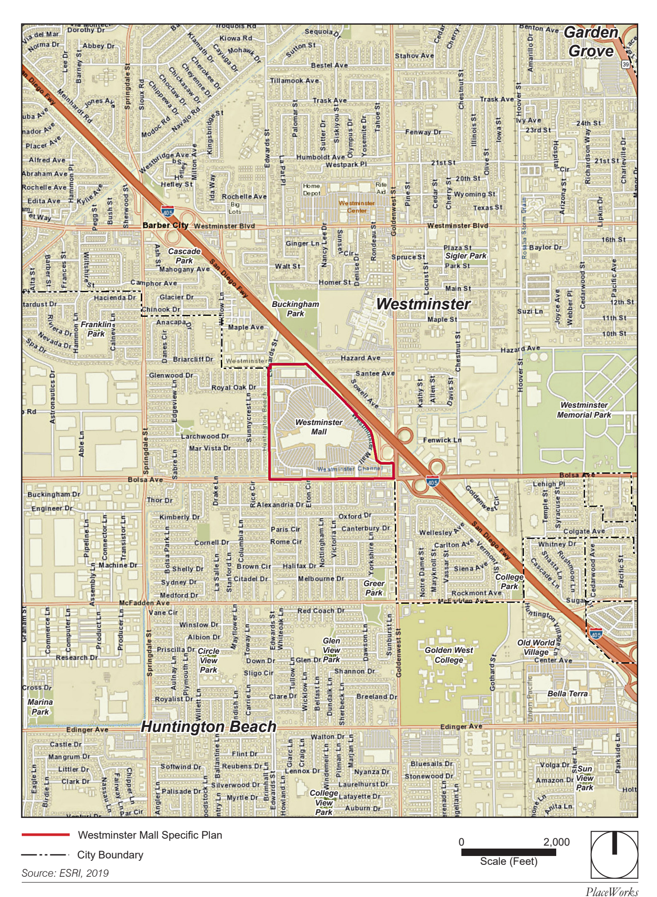
Figure 2 - Local Vicinity