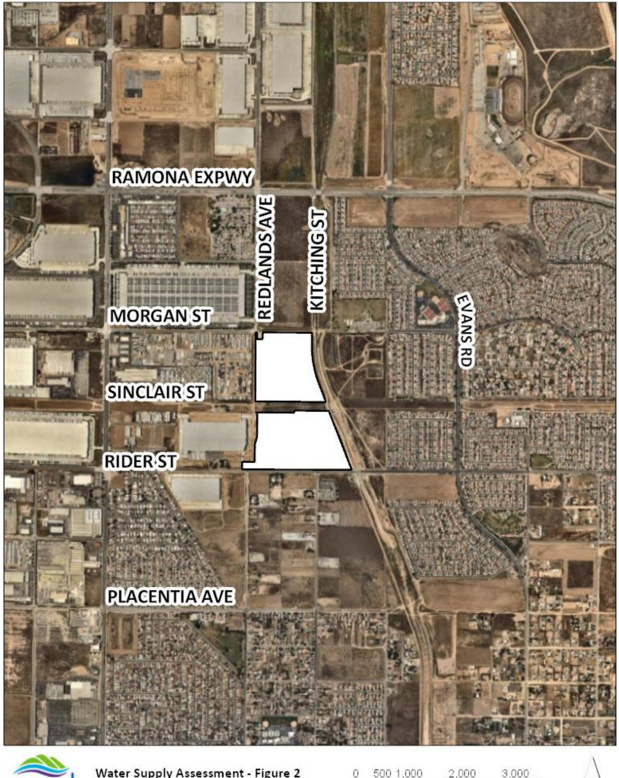
Figure 2: Project Location