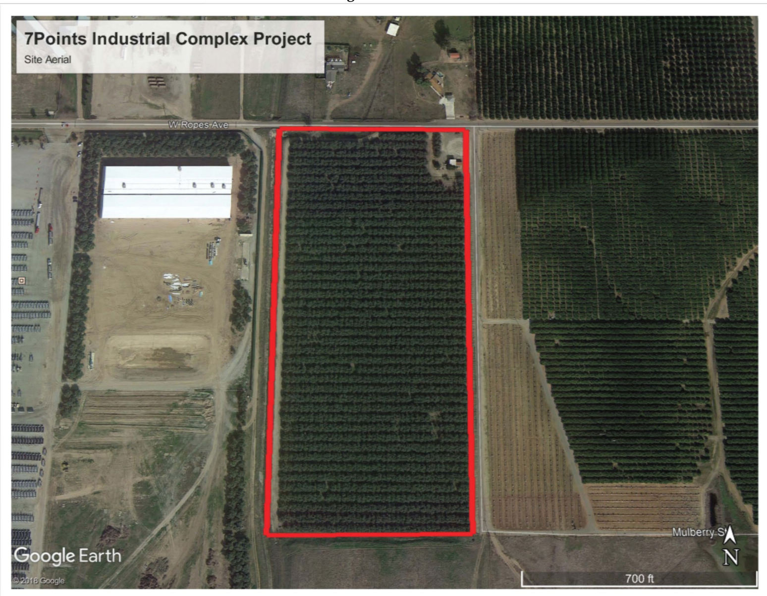
Figure 2 – Site Aerial