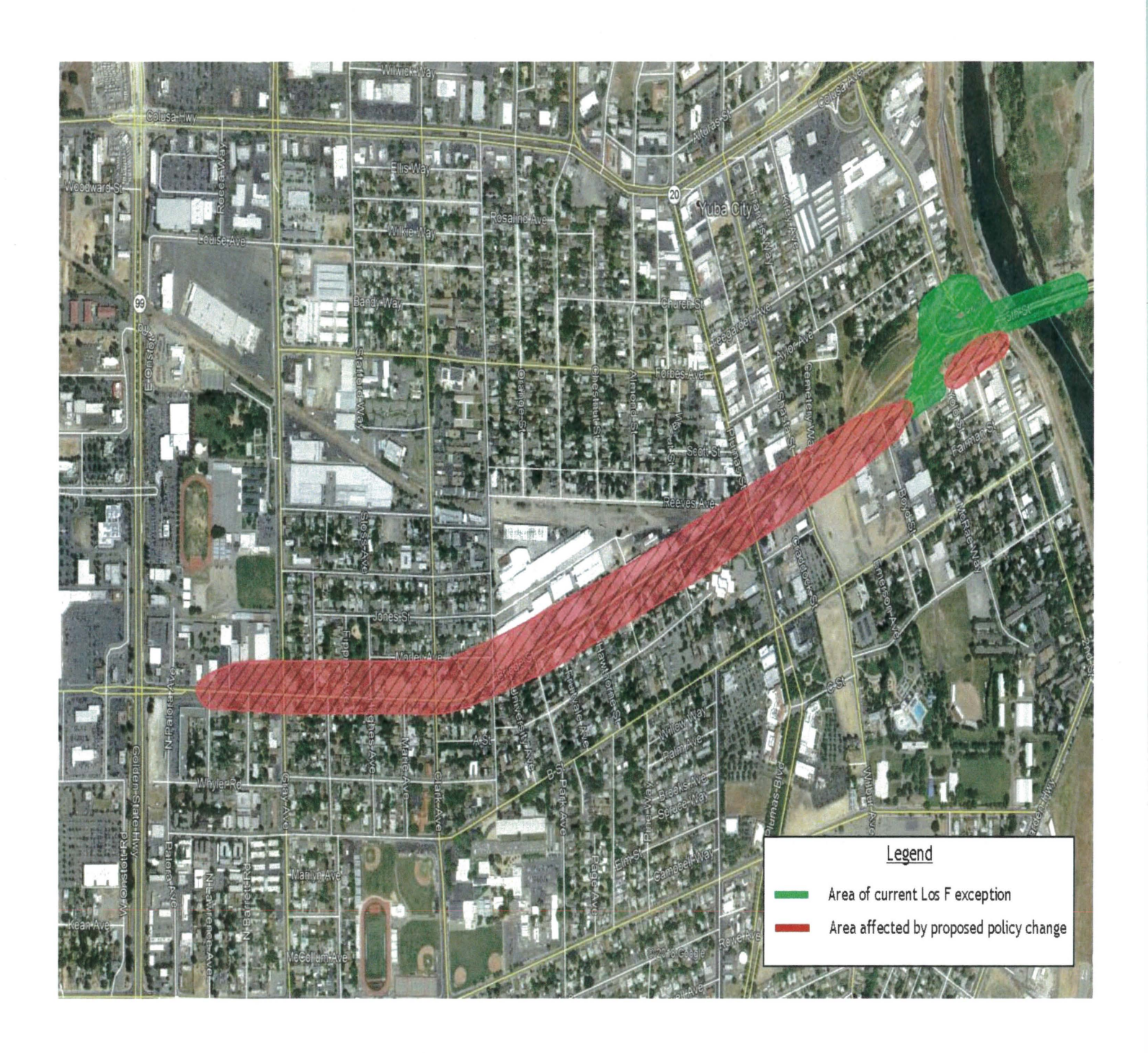
Figure 2 – Bridge Street Level of Service Study Area