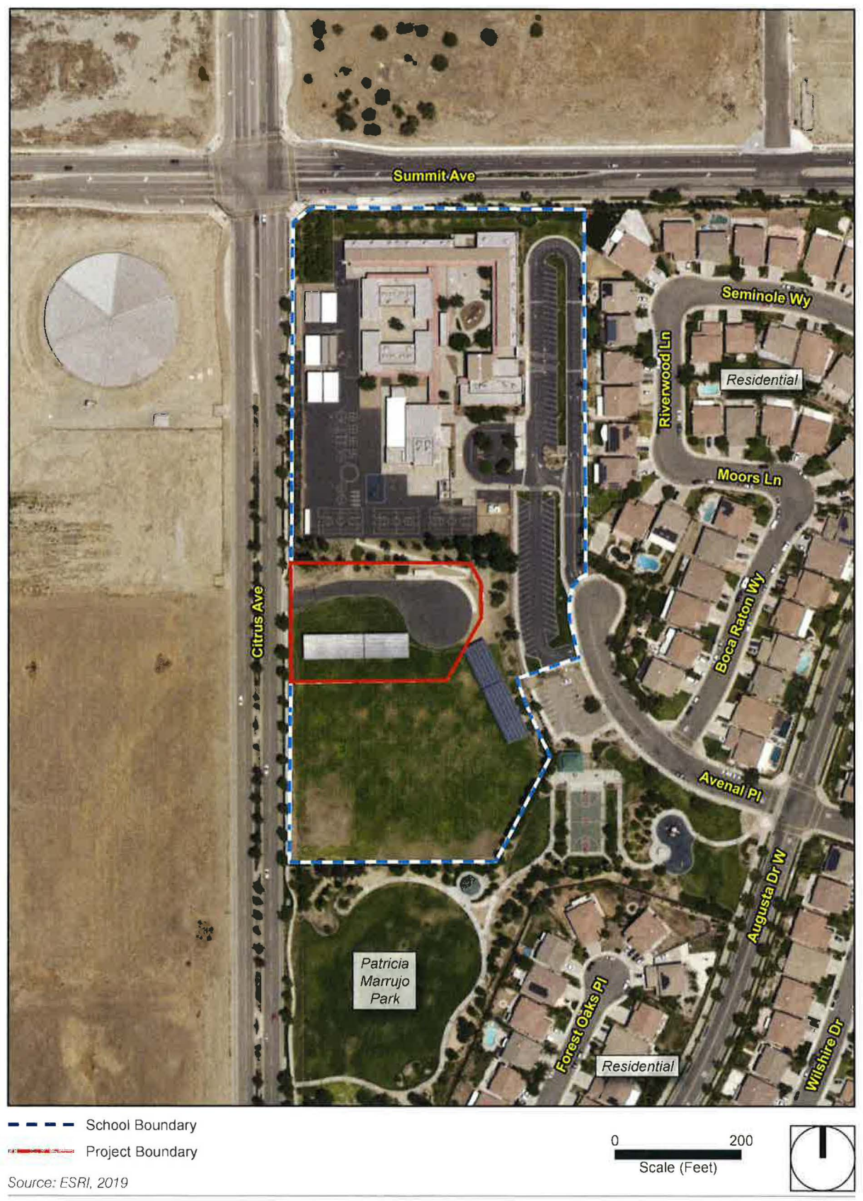
Figure 3 - Aerial Photograph