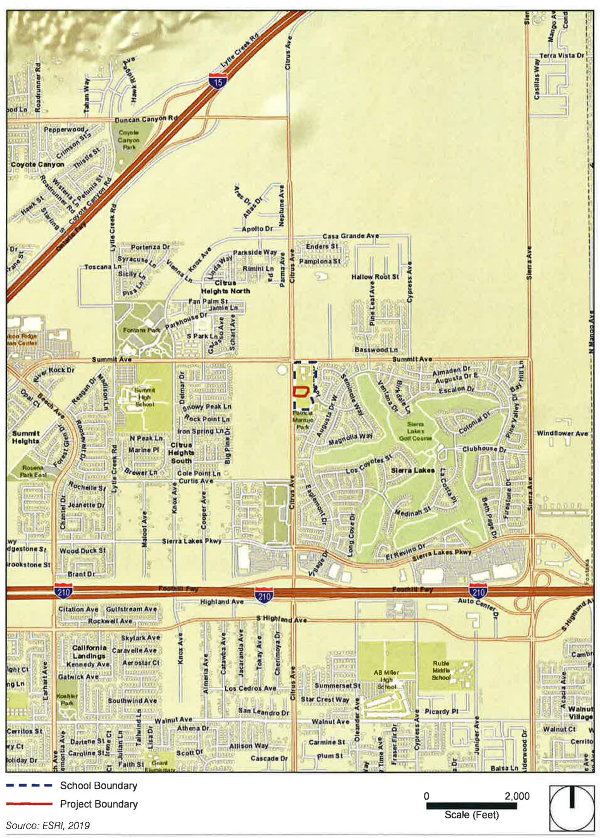
Figure 2 - Local Vicinity