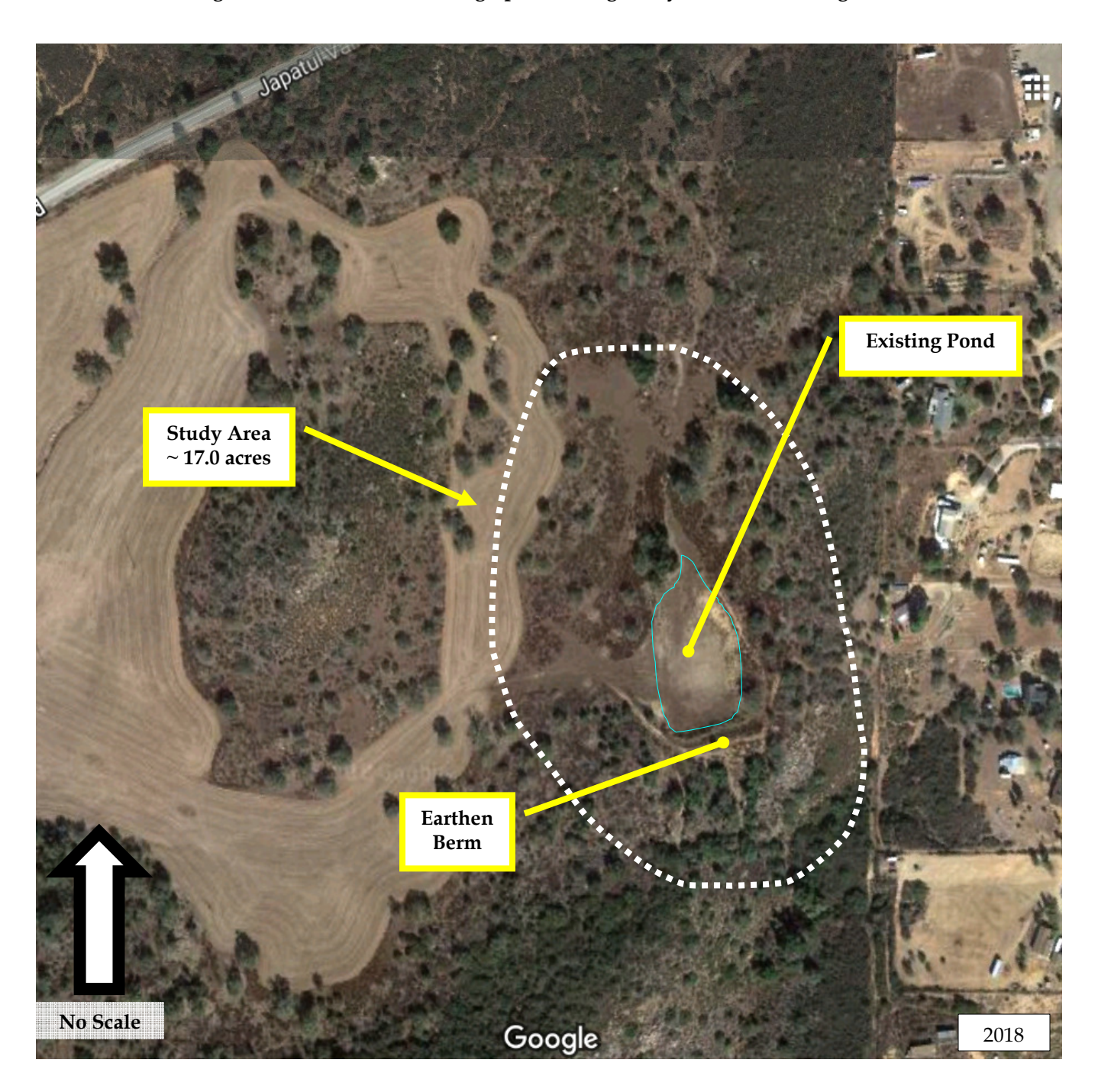
Figure 1. Current Aerial Photograph Showing Study Area and Existing Pond