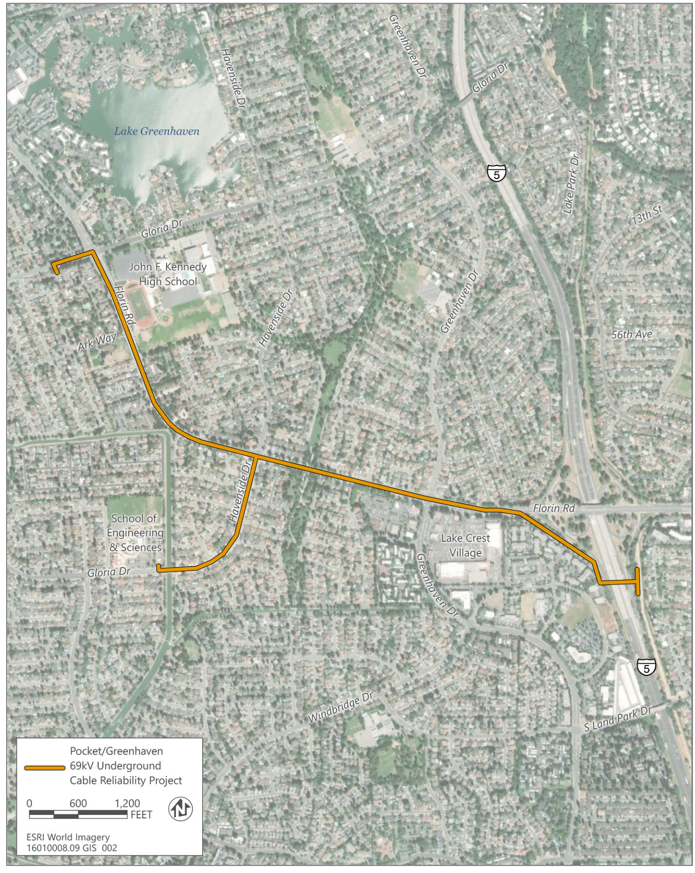
Exhibit 2-2 Project Alignment Page 11 of 92