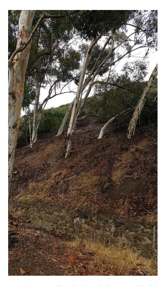
Photo Figure 5: View of Non-Native Woodland/Island Chaparral habitat included a dense cover of eucalyptus with a blend of Island Chaparral habitat further upslope.