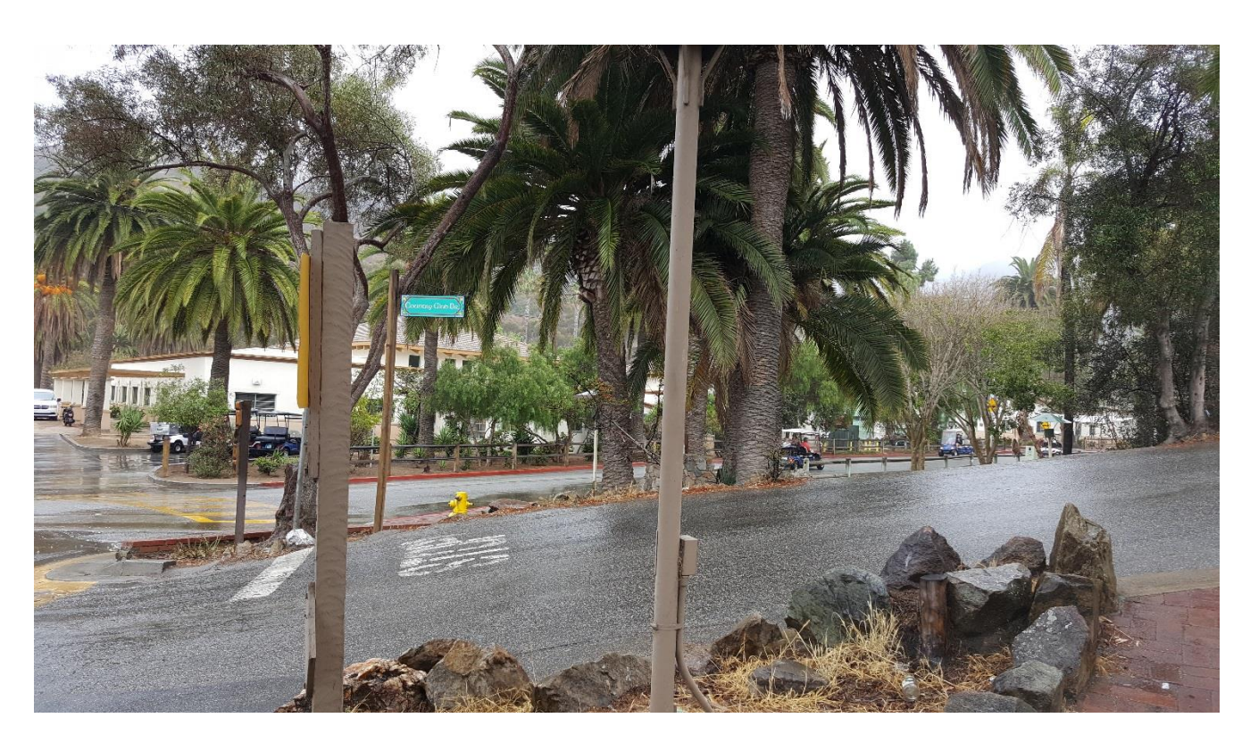
Photo Figure 1: Facing Southeast from northwest section of the intersection area. Example of Developed area in BSA.