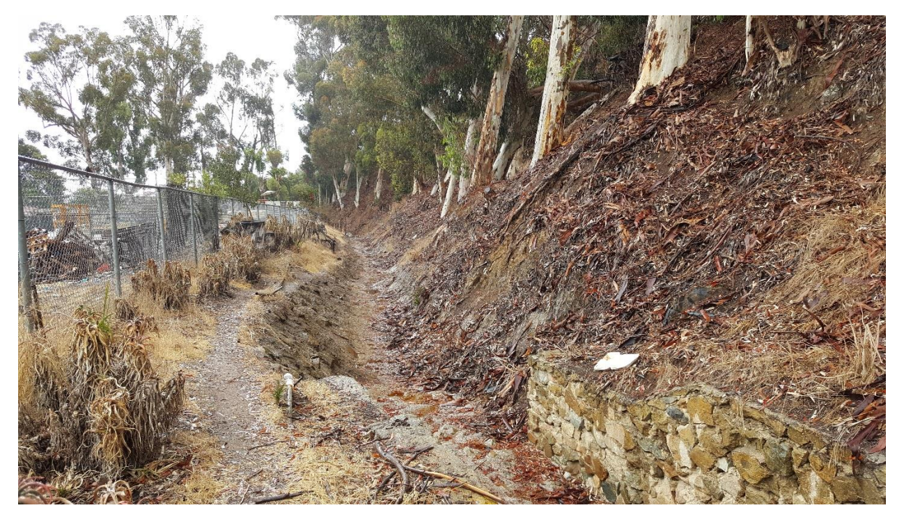
Photo Figure 8: Characteristic conditions of Avalon Creek, facing downstream towards the proposed project area.