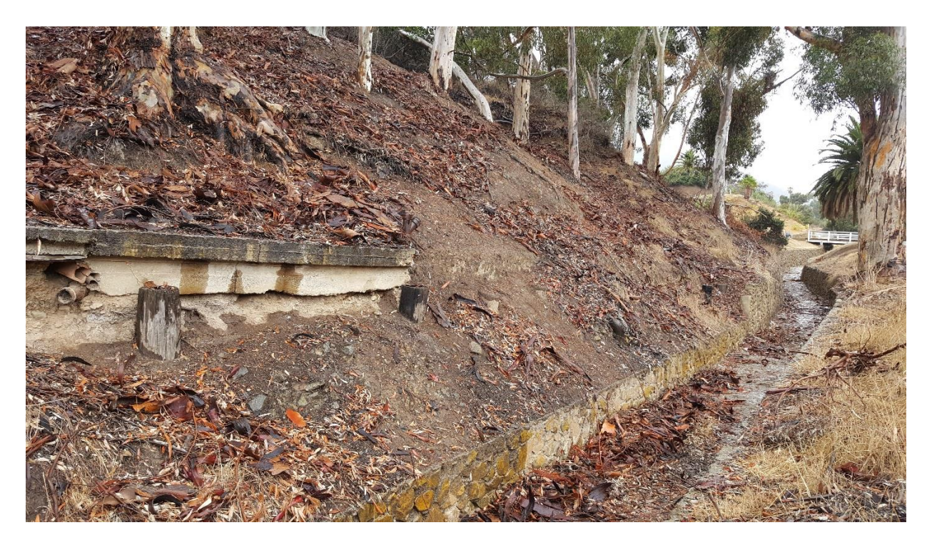
Photo Figure 7: Characteristic conditions of Avalon Creek, facing upstream towards golf course.