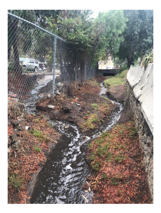
Photo Figure 11: Characteristic conditions of stormwater channel system, in the proposed project area, taken during a rain event at the confluence of the inputs from areas shown in Photo Figures 9 and 10.