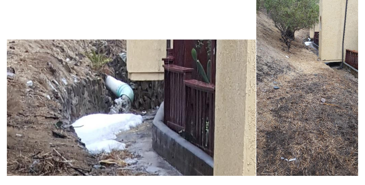
Photo Figure 9: Characteristic conditions of stormwater inputs to the channel system, north of the proposed project area, taken during a rain event.