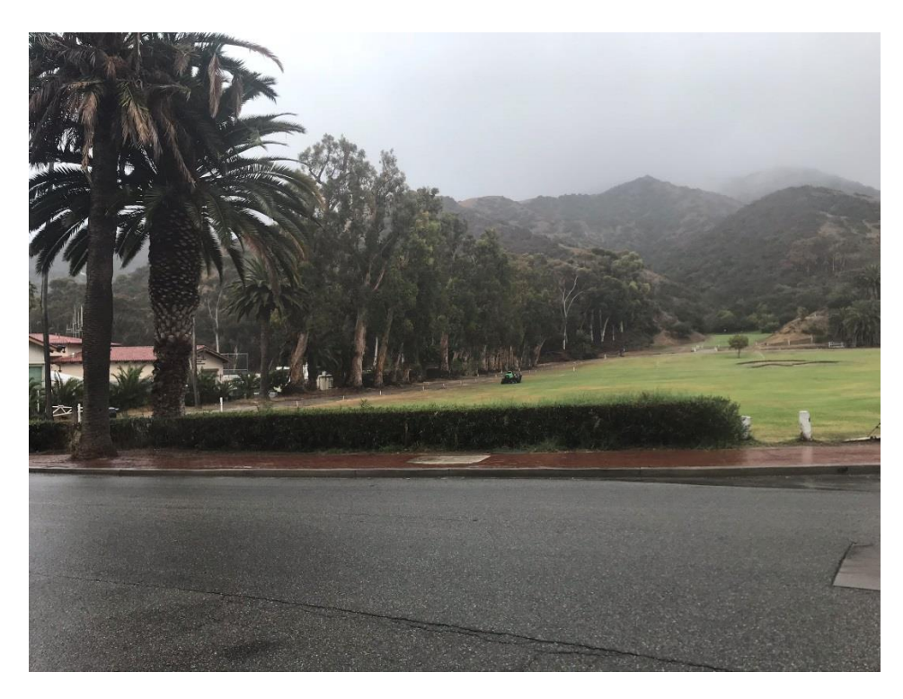
Photo Figure 4: View of golf course area and example of Disturbed area with ornamental eucalyptus trees in BSA.