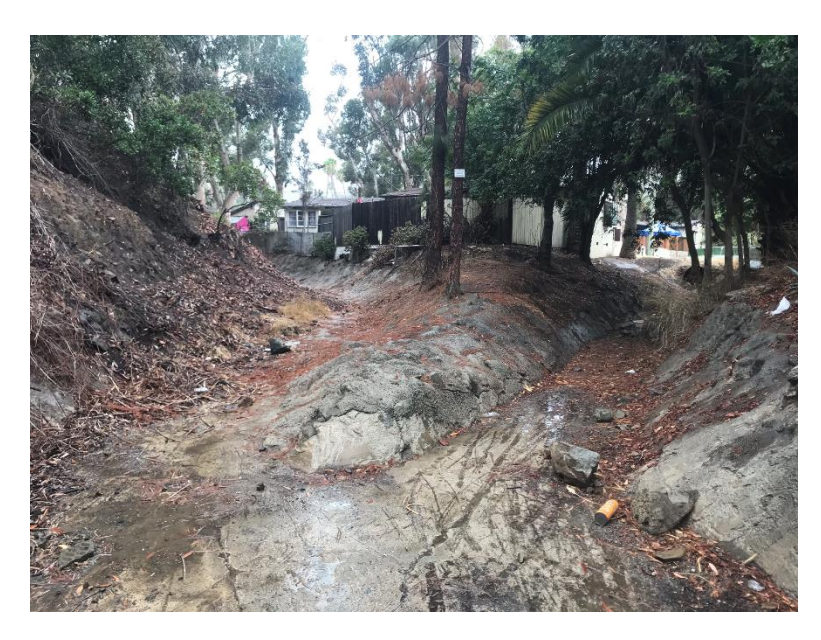
Photo Figure 14: Characteristic conditions at the confluence of Avalon Creek and the stormwater channel that is parallel to Fremont Street. Both features have constructed bottoms.