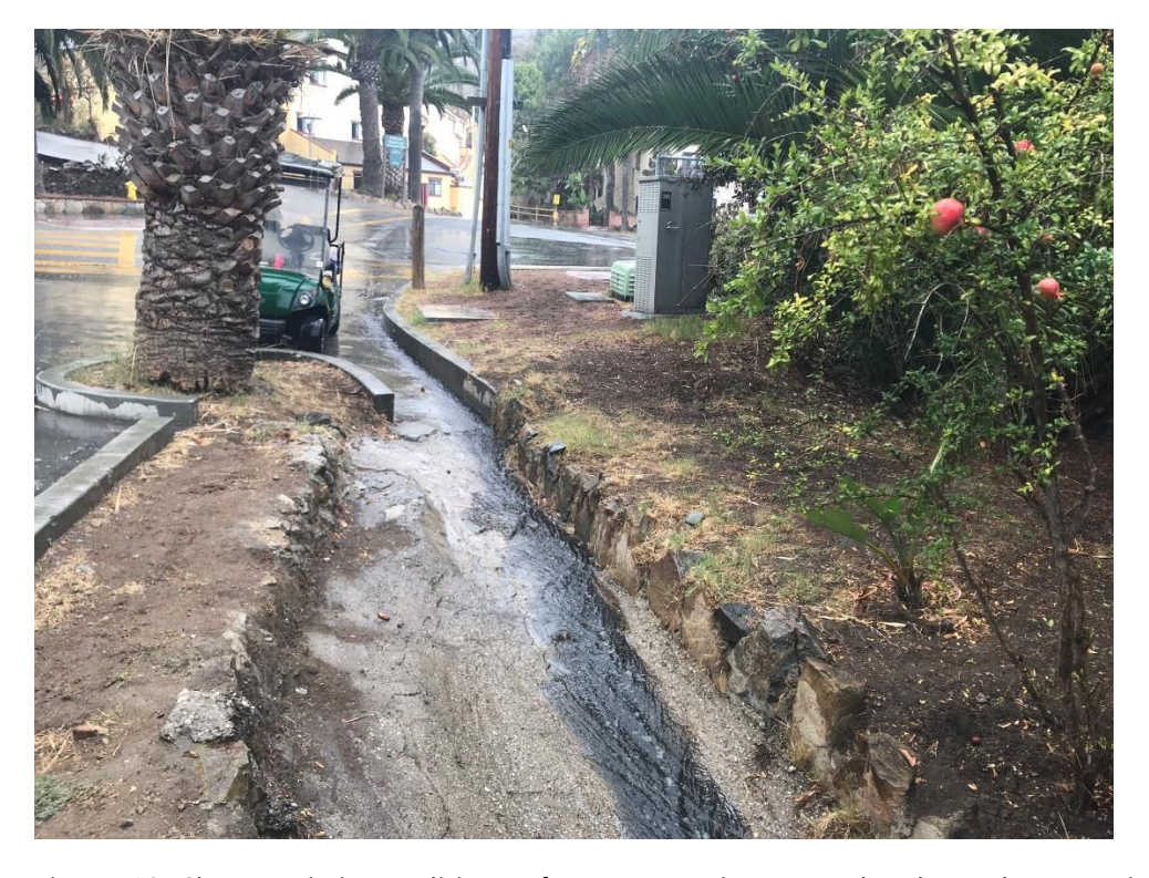
Photo Figure 10: Characteristic conditions of stormwater inputs to the channel system, in the proposed project area, taken during a rain event.