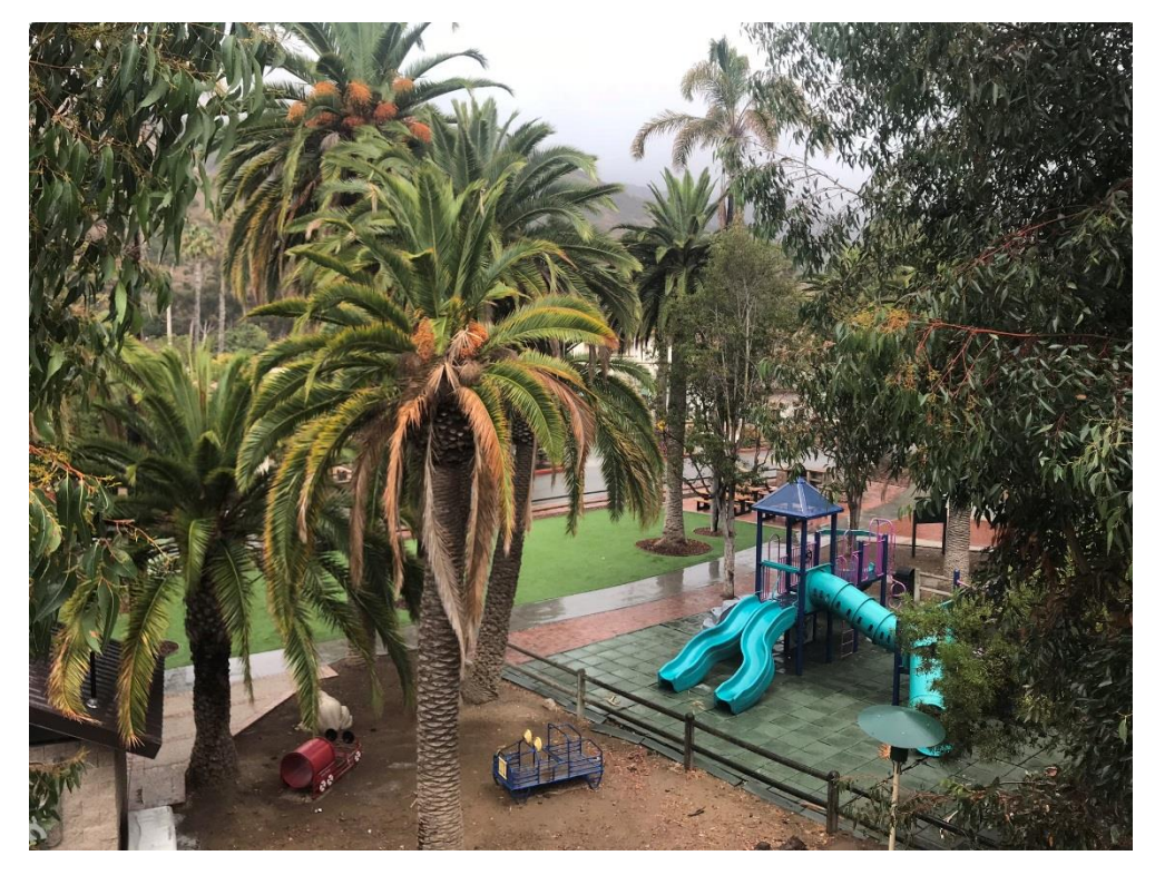
Photo Figure 2: Facing Southeast from northwest section of the BSA. Example of Developed area in BSA.