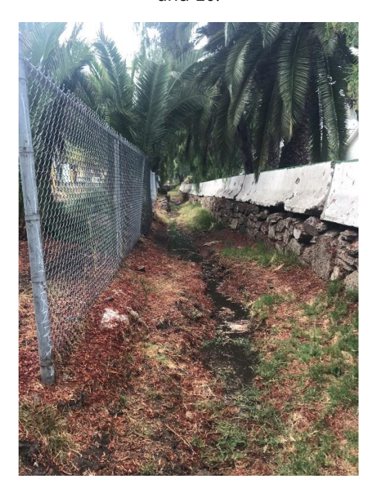
Photo Figure 12: Characteristic conditions of stormwater channel system, in the proposed project area, taken during a rain event below the confluence of the inputs from areas shown in Photo Figures 11, 10, and 9.