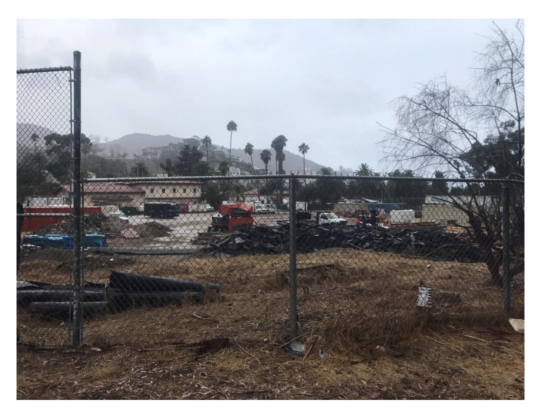
Photo Figure 3: View of proposed staging area and example of Disturbed area in BSA.