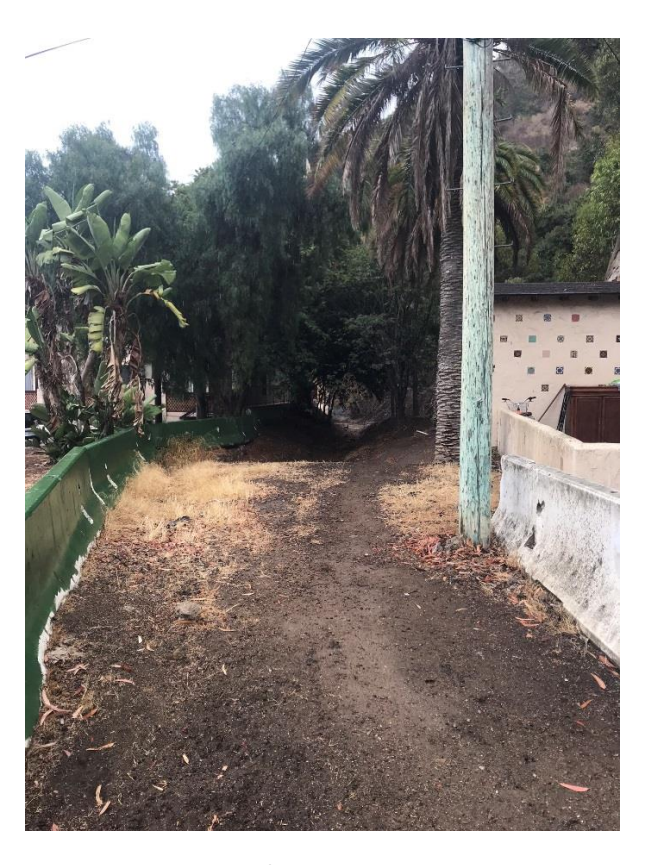
Photo Figure 13: Characteristic conditions of stormwater channel system, in the proposed project area, taken during a rain event below areas shown in Photo Figures 12, 11, 10, and 9.