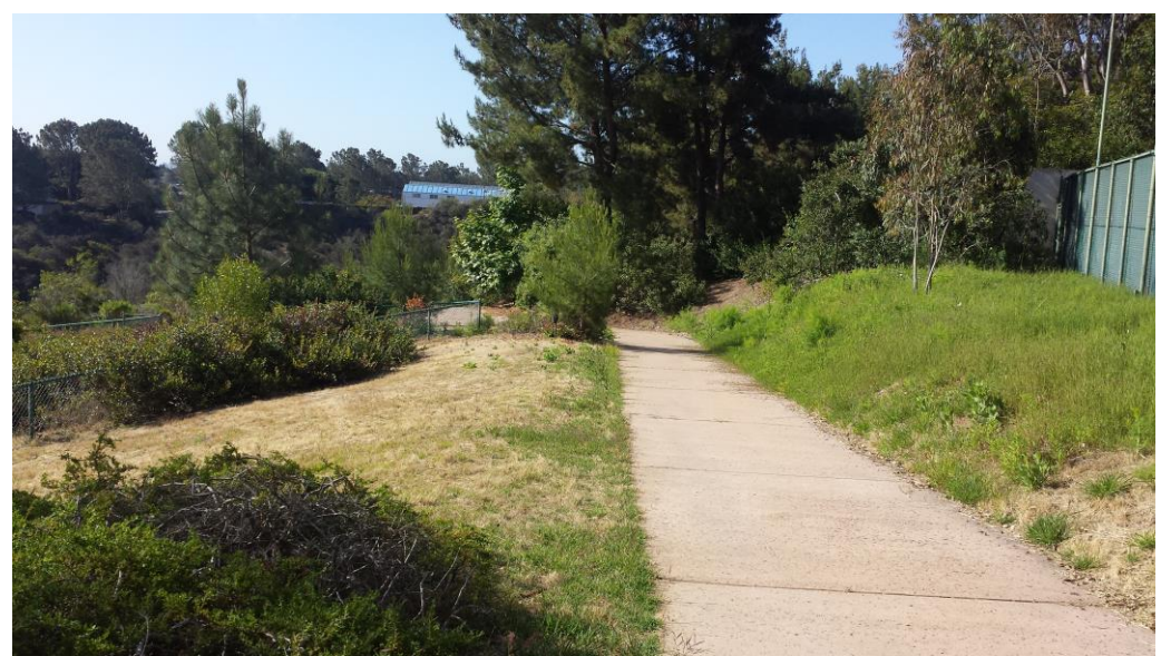
Overview of disturbed landscape between tennis courts and helicopter pad, view to the south-southeast.