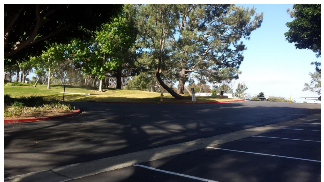
Overview of landscaping and paved roadway from the northwest corner of project, view to the southwest.