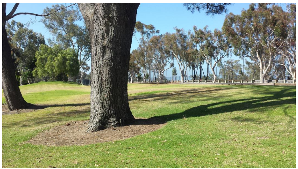
Landscaped portion of the project adjacent to North Torrey Pines Road (right), view to the southwest.