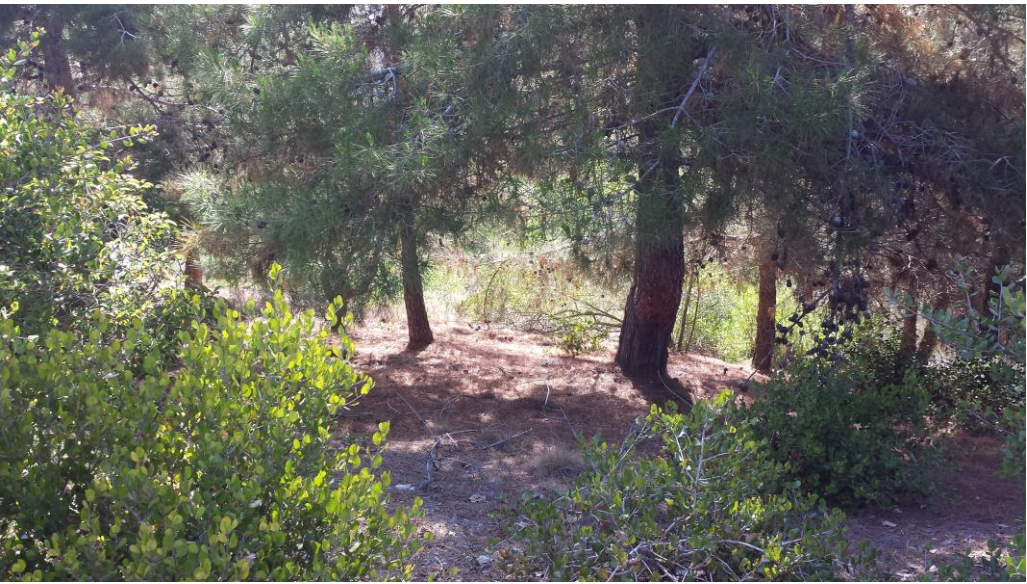
Slope at the southeast corner of the project area, view to the south.