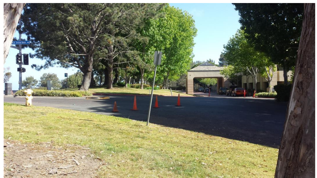
Landscaped portion of project adjacent to North Torrey Pines Road, showing existing structure, view to the north.