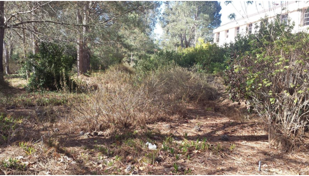
Overview of thick vegetation in northern portion of project area, view to the east.