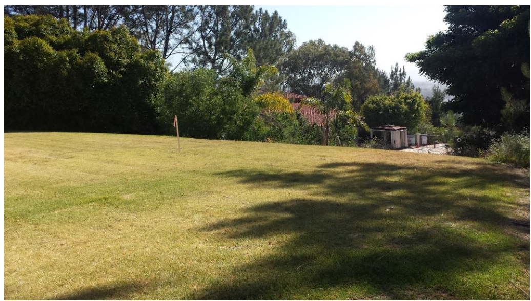
Overview of manicured yard and landscaping, with pool area in the background (right), view to the northeast.