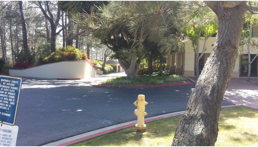
Northern portion of project area, showing landscaping, pavement; view to the east.