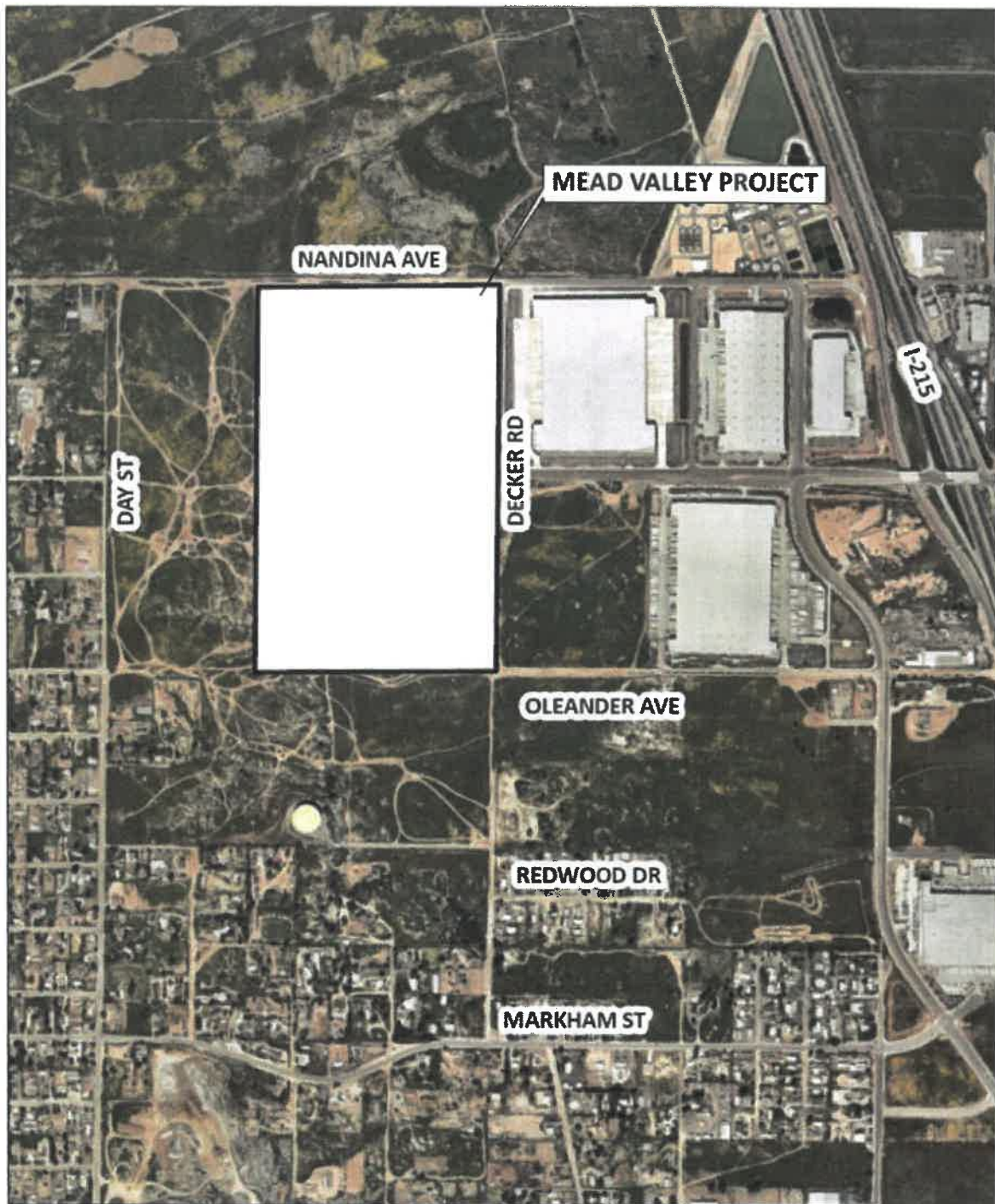
Figure 2: Project Location