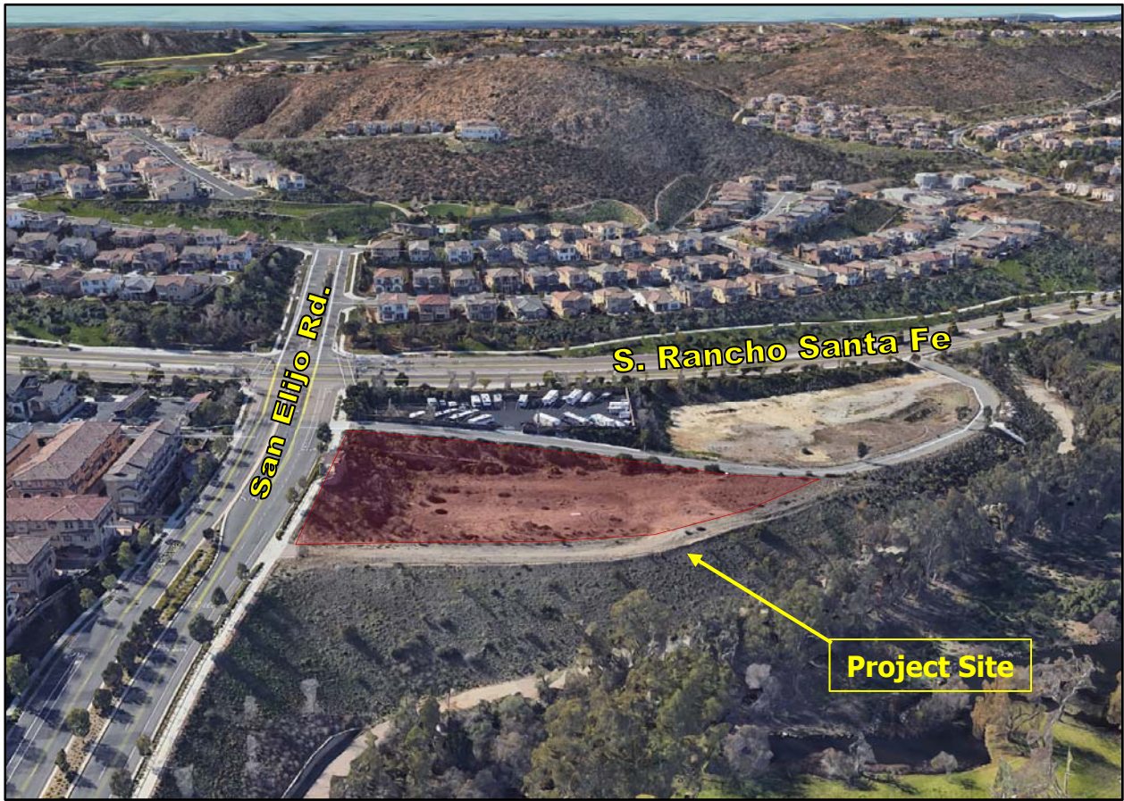
Figure 2-A: Existing Site Layout