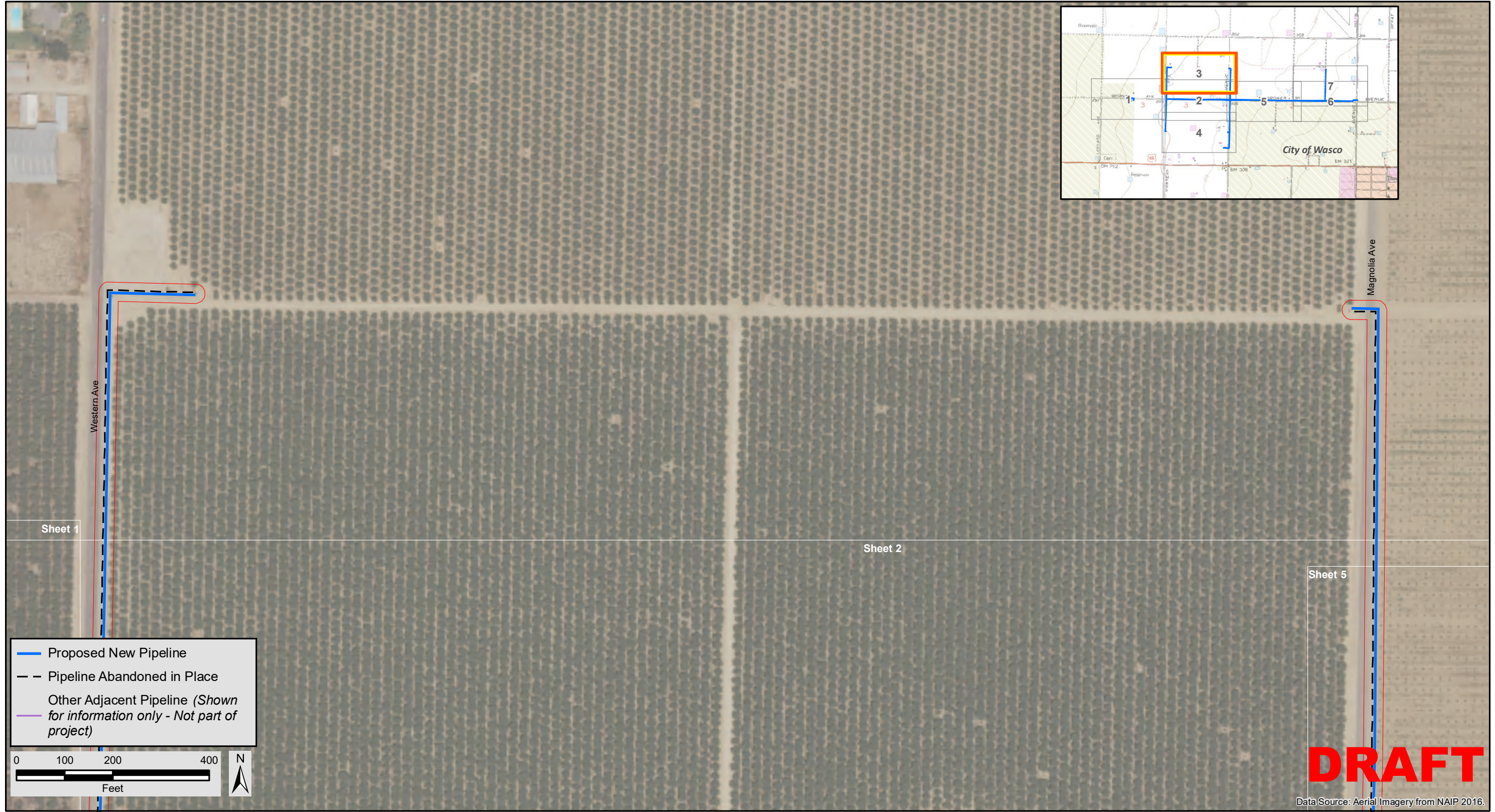
Figure Source: GEI Consultants, Inc. 2018.