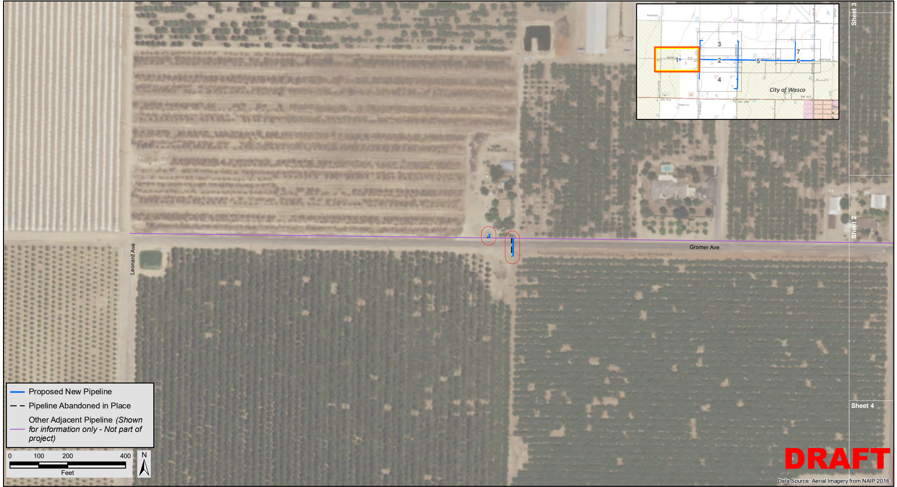
Figure Source: GEI Consultants, Inc. 2018.