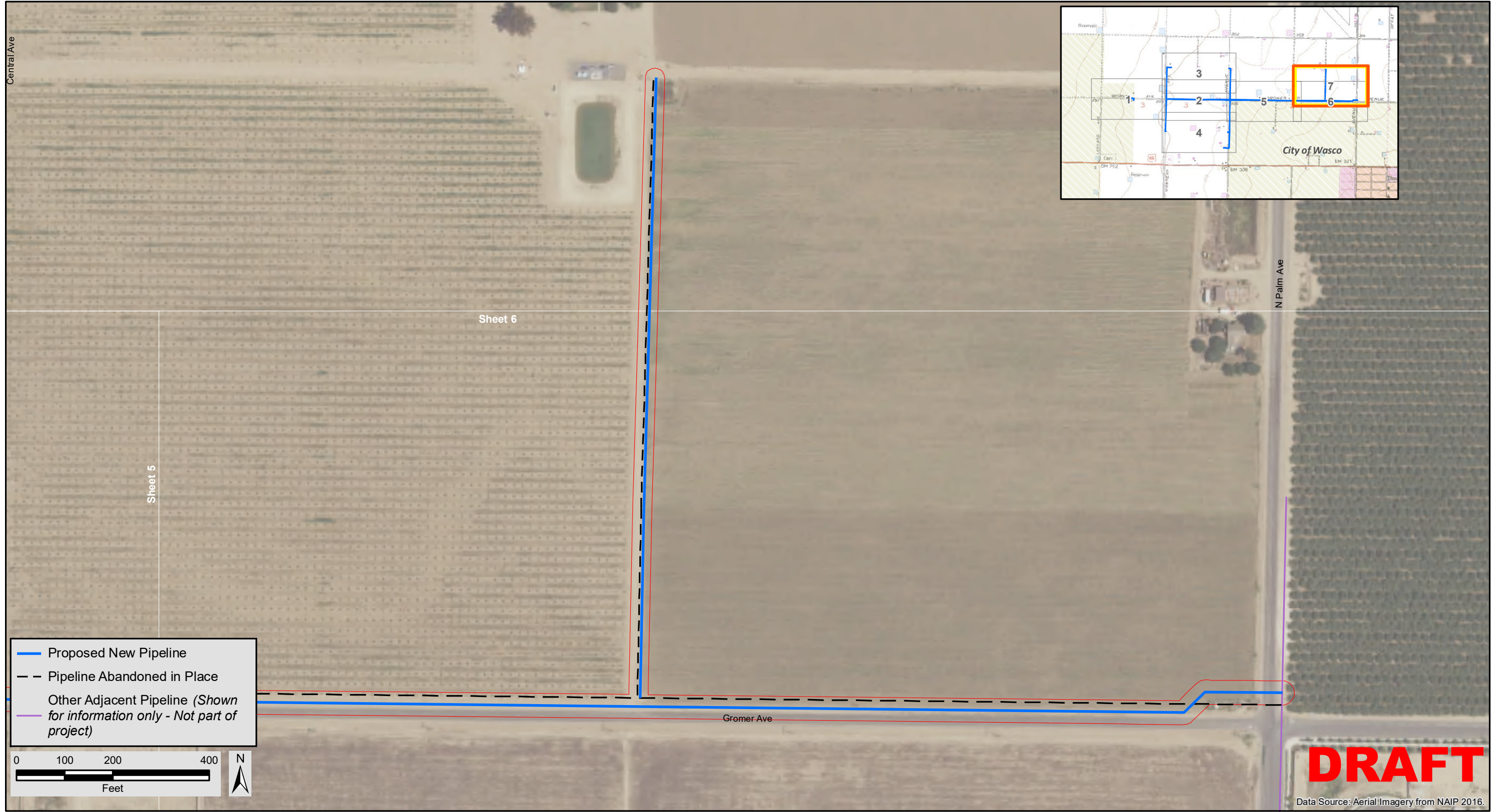
Figure Source: GEI Consultants, Inc. 2018.