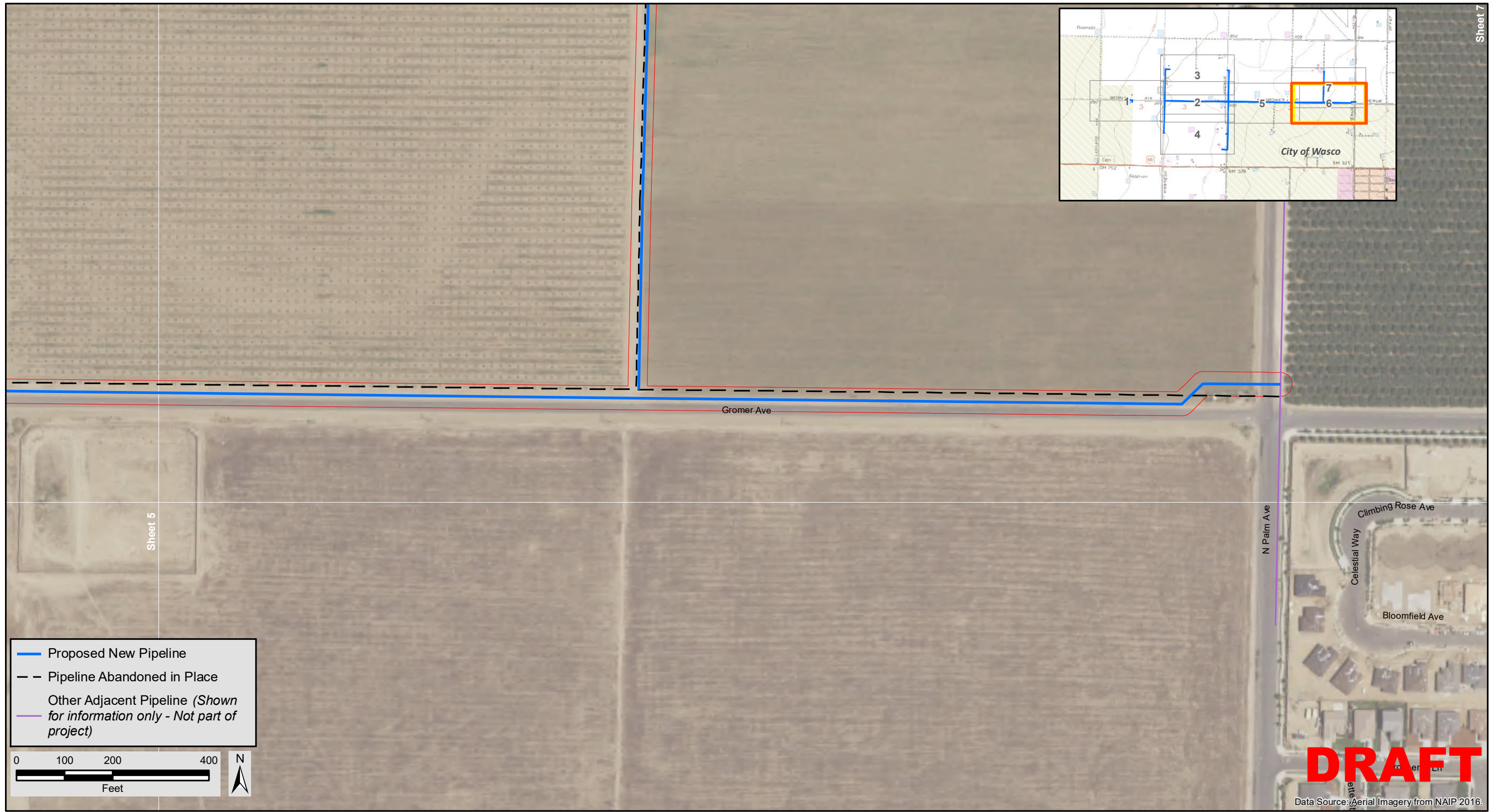
Figure Source: GEI Consultants, Inc. 2018.