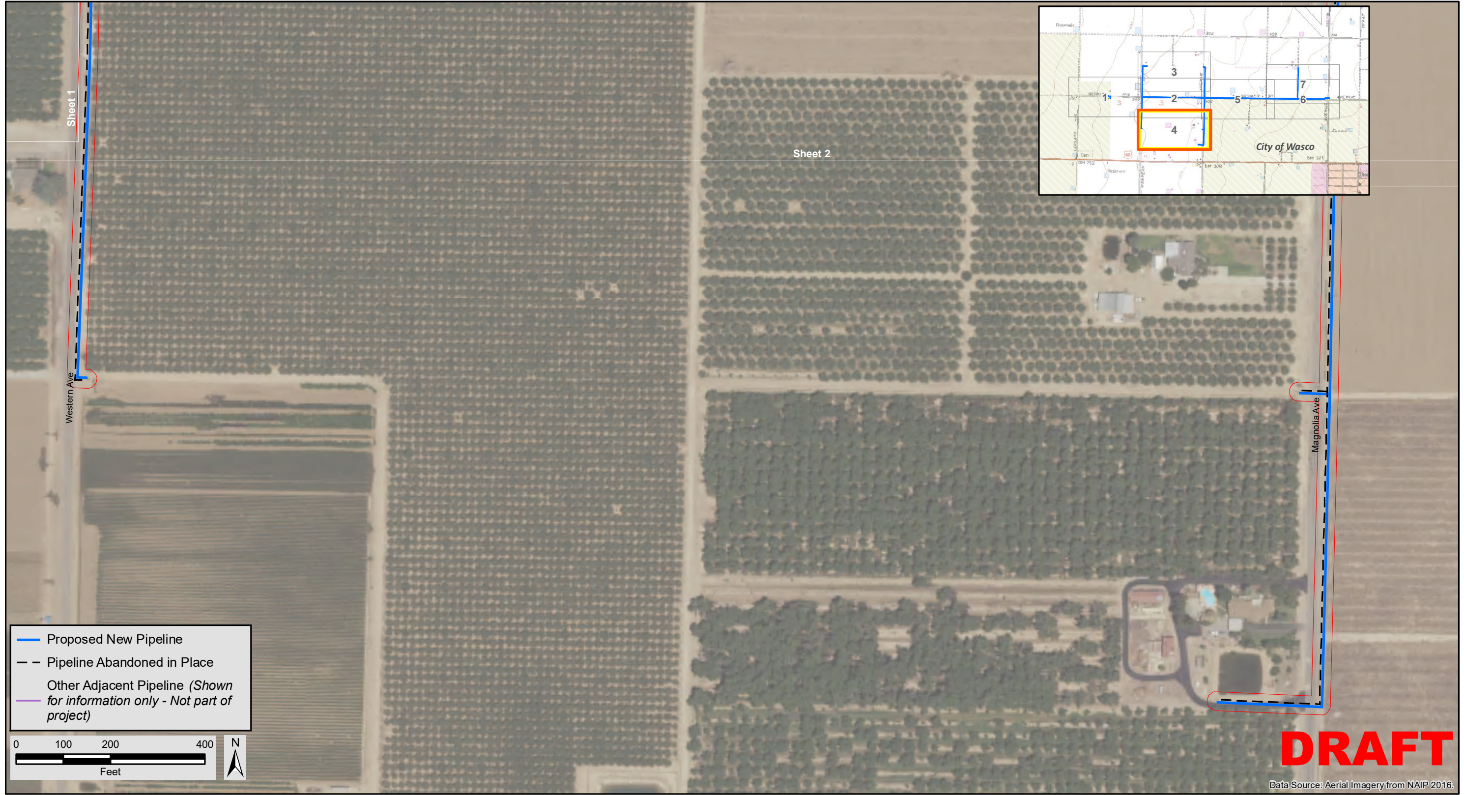
Figure Source: GEI Consultants, Inc. 2018.