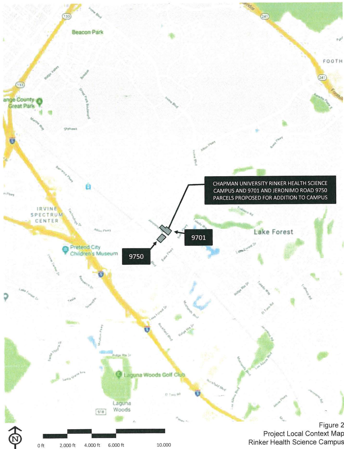
Figure 2 Project Local Context Map Rinker Health Science Campus