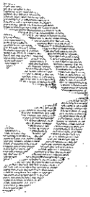
Figure 2 - Land Use Jurisdictional Boundary Exhibit