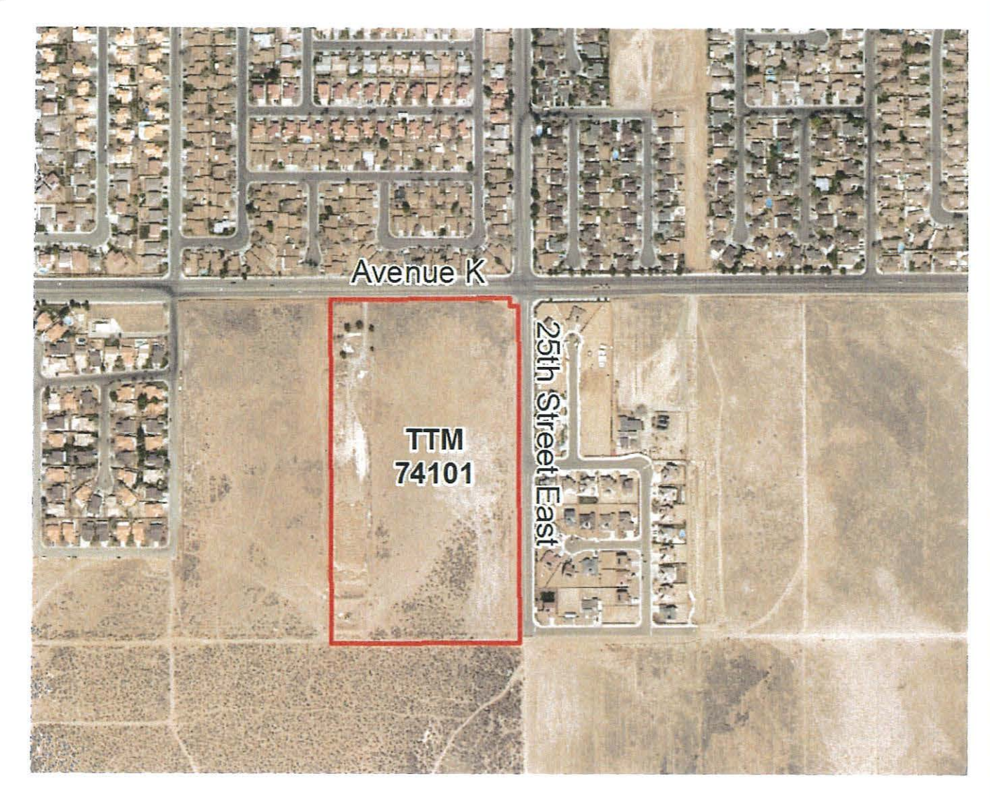
Figure 1, Project Location Map