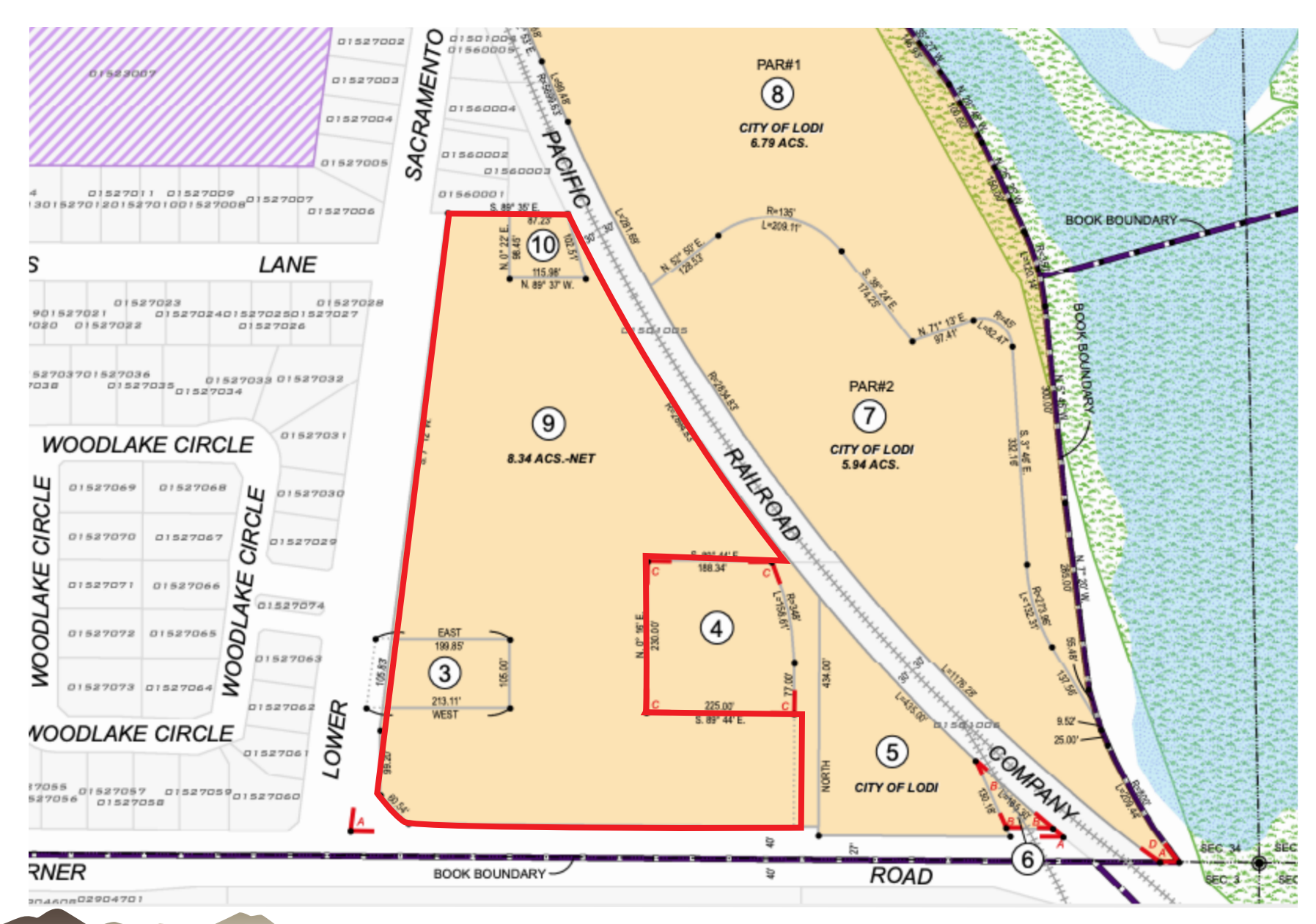
Figure 3 ASSESSOR PARCEL MAP