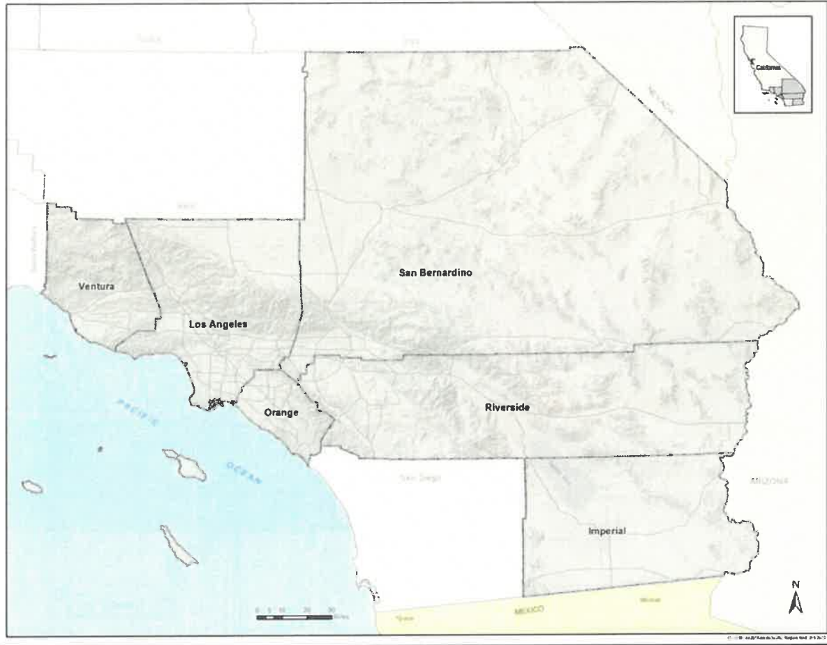
Figure 1: SCAG Region