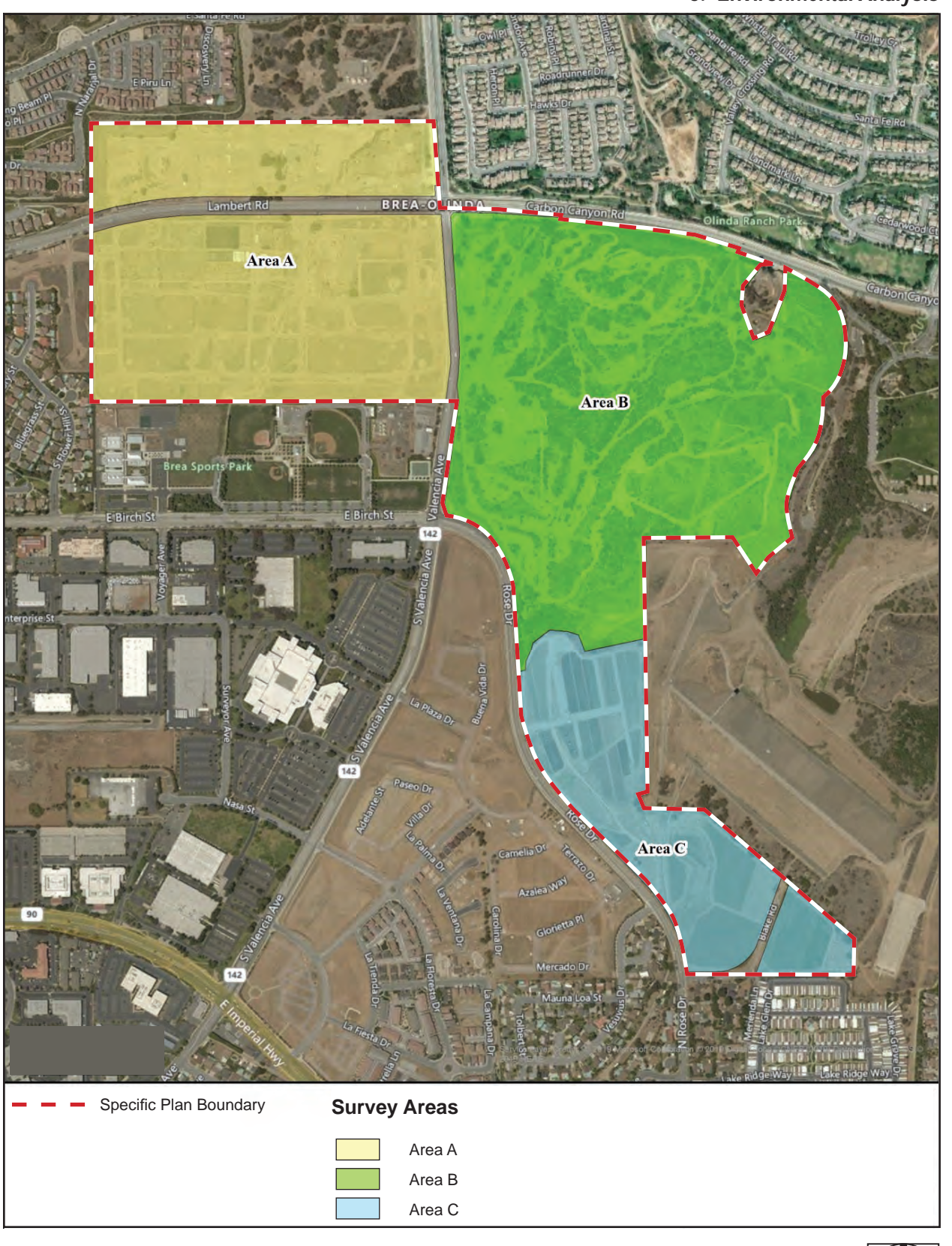
Figure 5.5-1 - Cultural Resources Survey Area 5. Environmental Analysis