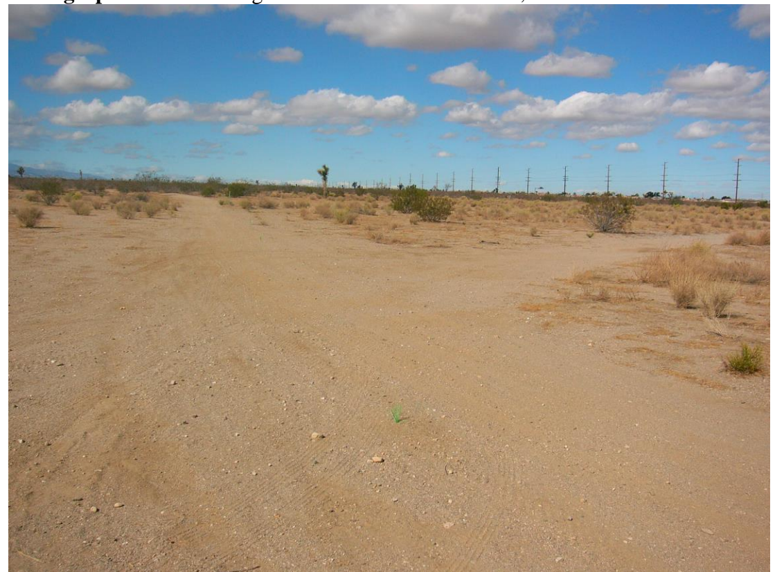
Photograph 6: Site looking east from west-central area, October 2018.