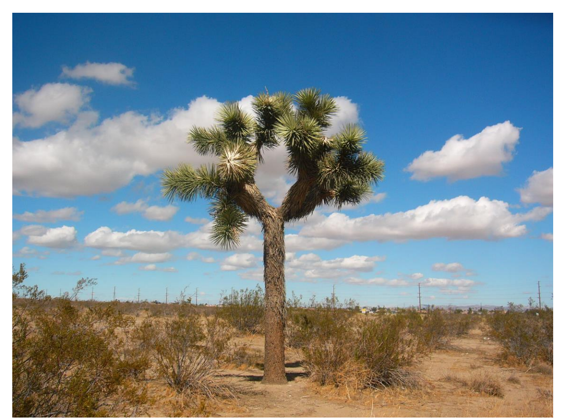
Photograph 7: Joshua tree #1, southern portion of site, October 2108.