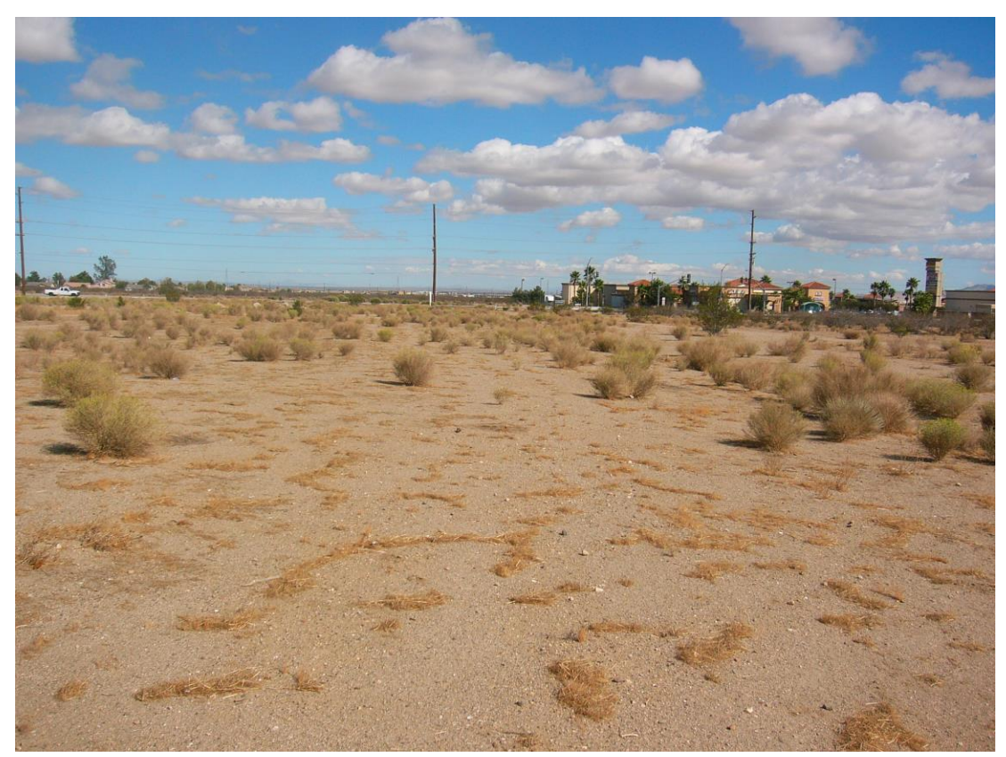
Photograph 5: Site looking north from west-central area, October 2018.