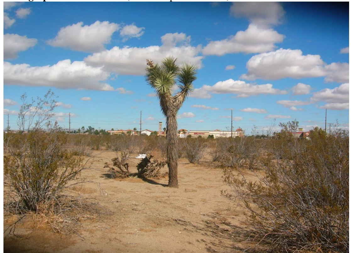
Photograph 8: Joshua tree #2, southern portion of site, October 2108.