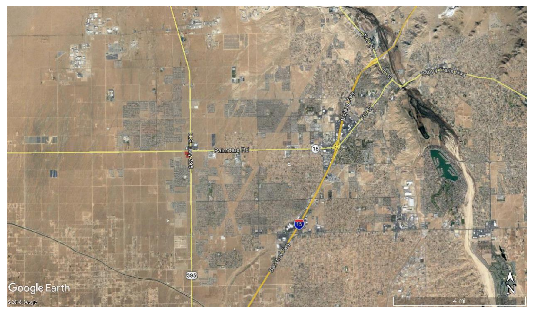
Exhibit 2: Location of the Desert Grove project site (in red).