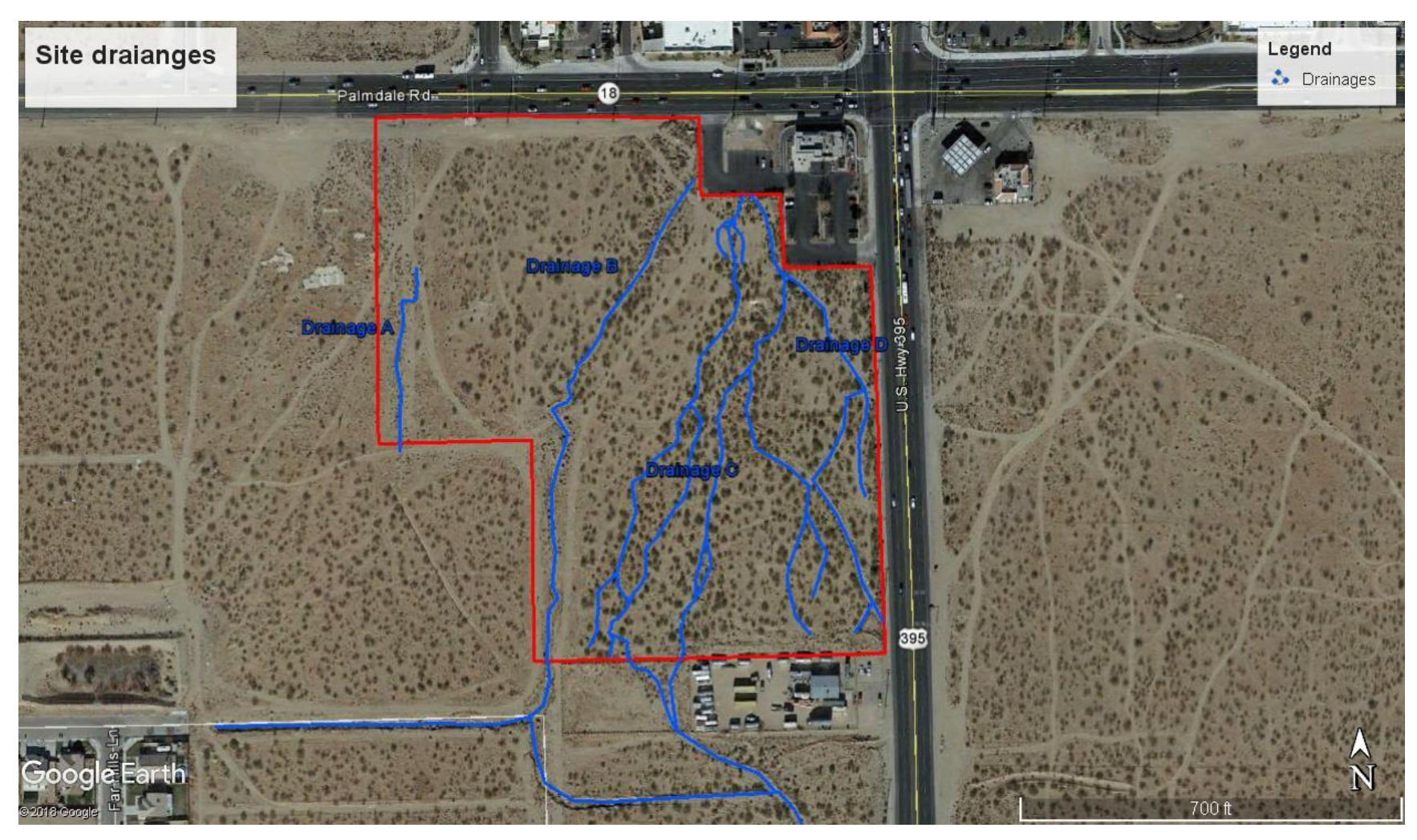
Exhibit 8: Desert Grove site (in red) drainages (blue line).