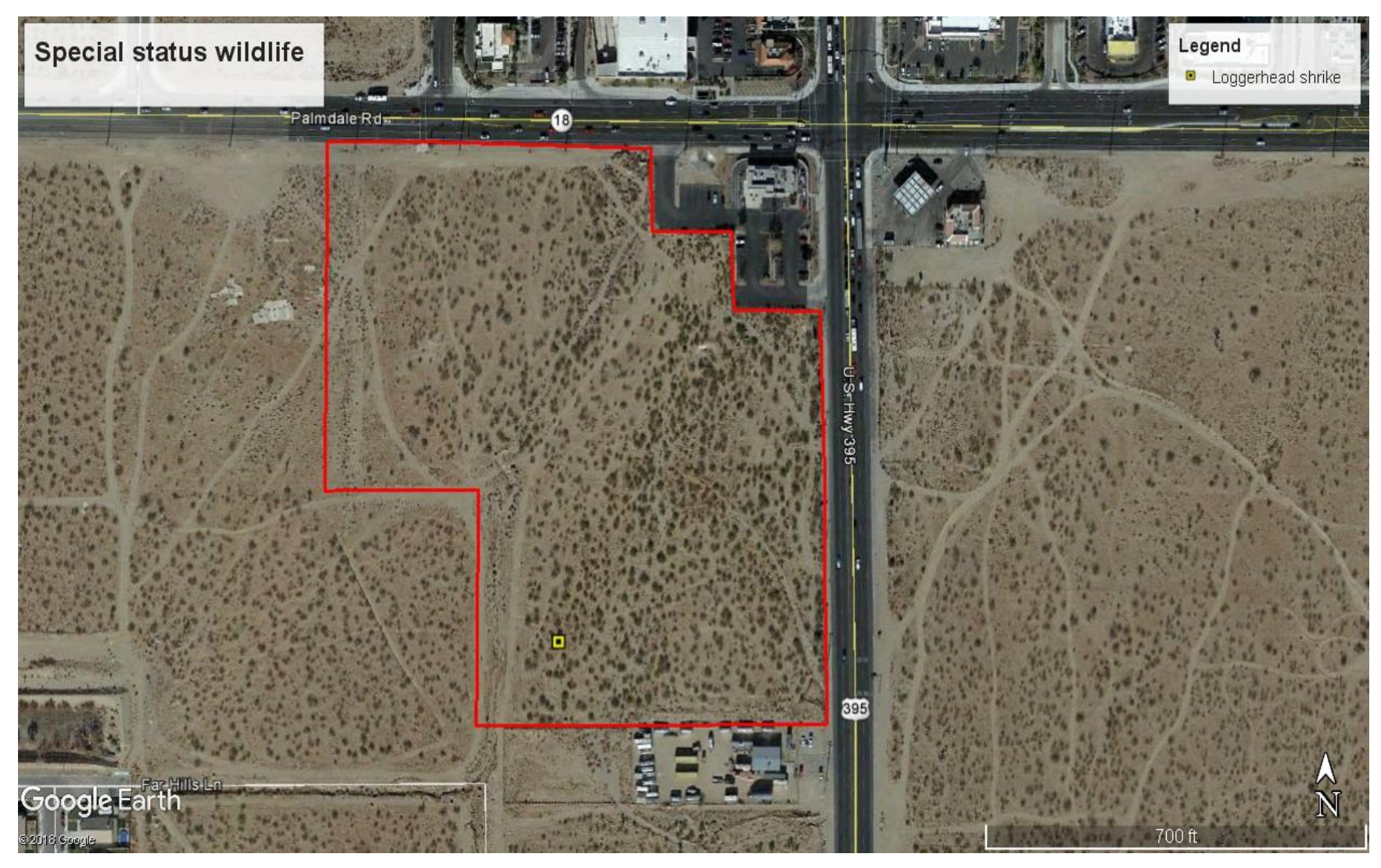
Exhibit 7: Location of special status wildlife at the Desert Grove project site (in red).