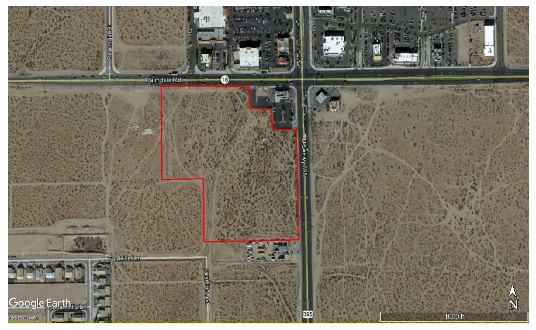
Exhibit 3: Location of the Desert Grove project site (in red).