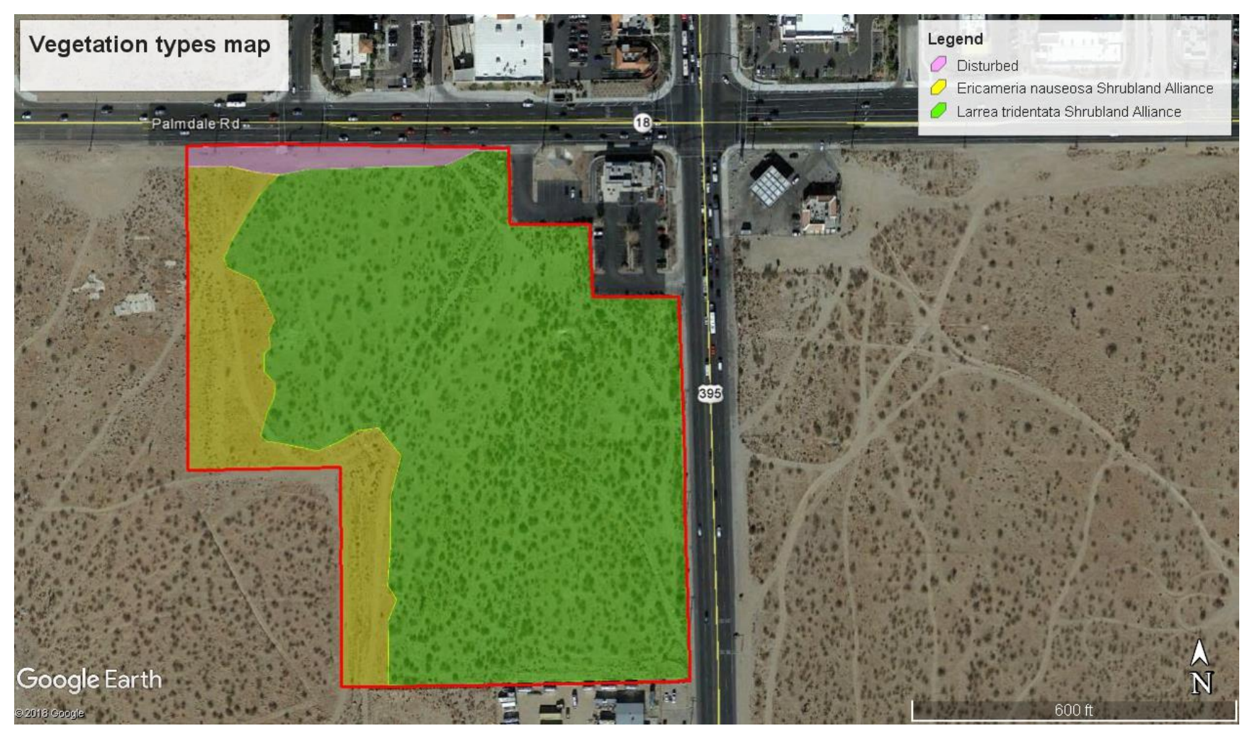
Exhibit 5: Vegetation map of Desert Grove site (in red).