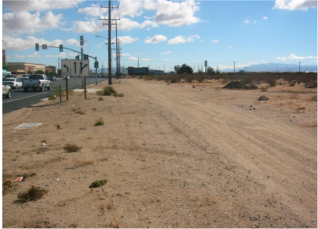
Photograph 4: Site looking east along northern boundary from northwestern corner, October 2018.

Photograph 3: Trash in basin, northeastern portion of site, October 2018.