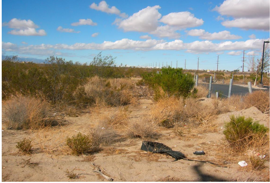
Photograph 2: Site looking west from northeastern end adjacent car park, October 2018.