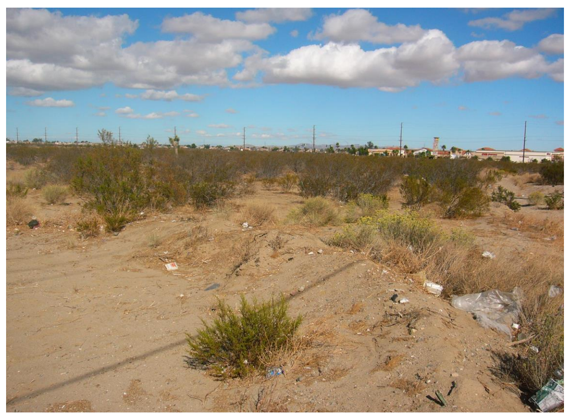
Photograph 1: Site looking northwest from southeastern corner, October 2018.