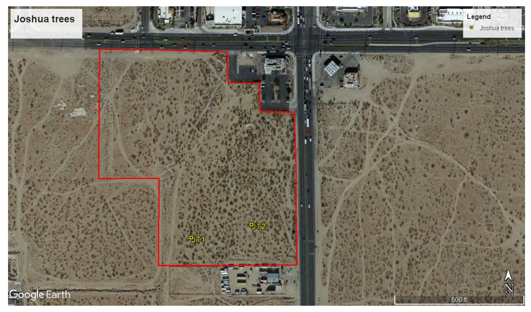
Exhibit 6: Location of Joshua trees at the Desert Grove project site (in red).