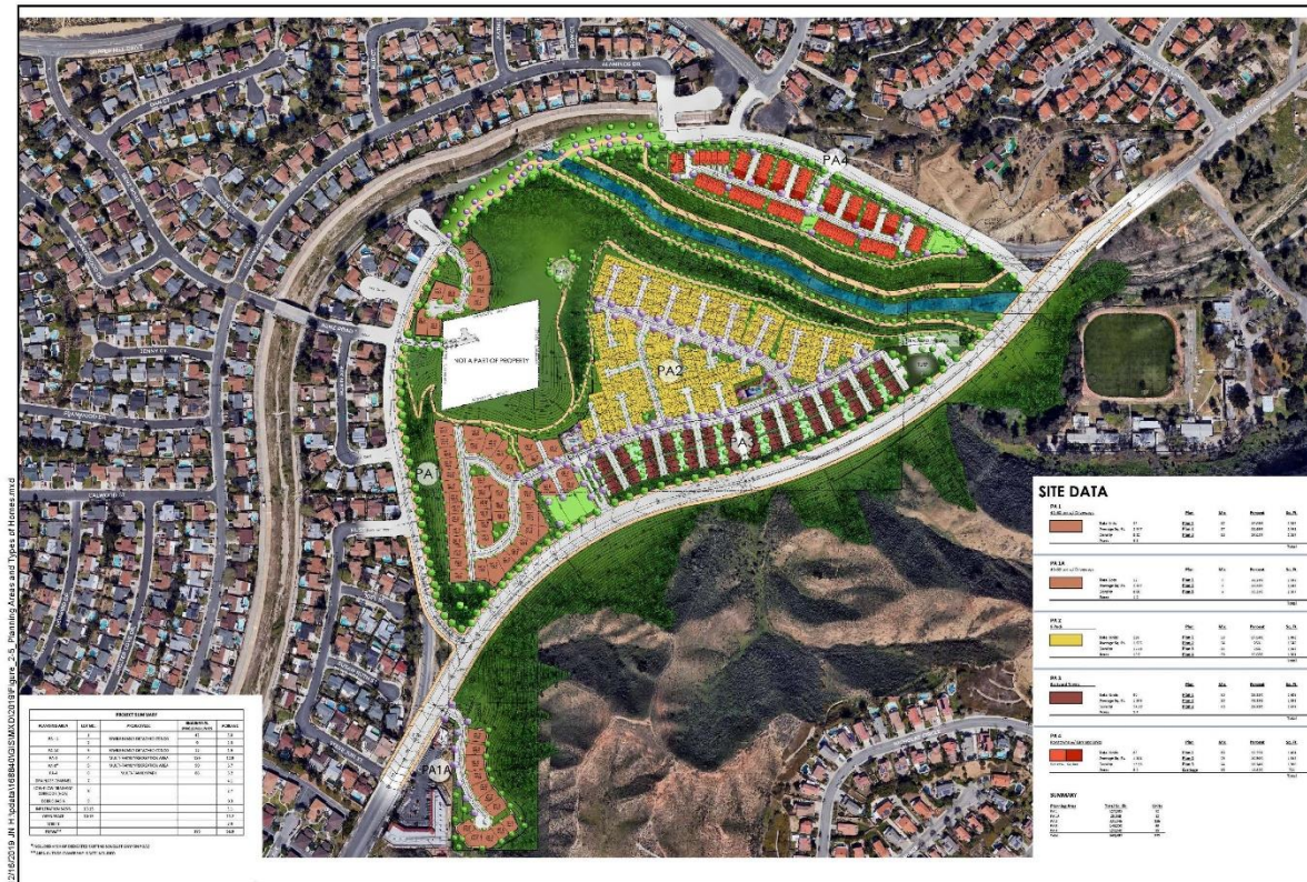
FIGURE 2-1 PROPOSED DEVELOPMENT PLAN