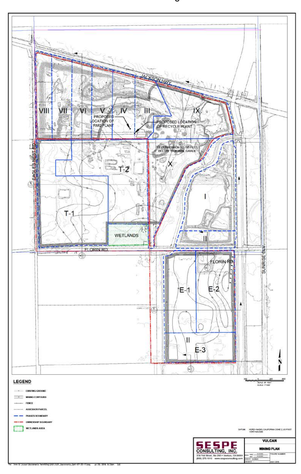
Plate NOP-2 Mining Plan