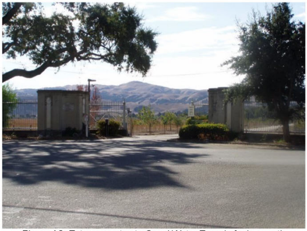
Figure A2: Entrance gates to Sunol Water Temple facing south (November 2019)