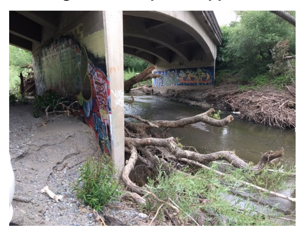
Prepared by the State of California, Department of Transportation

The environmental review, consultation, and any other actions required by applicable Federal environmental laws for this project are being, or have been, carried out by Caltrans pursuant to 23 USC 327 and the Memorandum of Understanding dated December 23, 2016, and executed by FHWA and Caltrans.