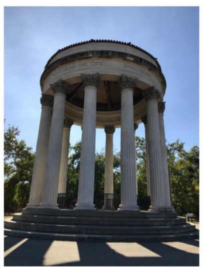
Figure A1: Sunol Water Temple facing south (Douglas Bright, Caltrans, November 2019)