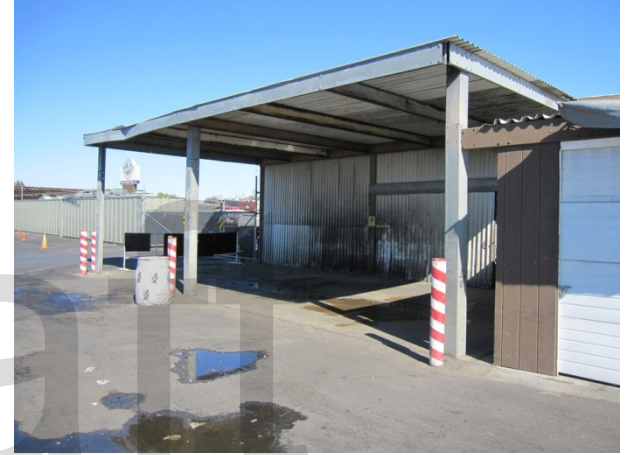
Photograph 12. Steam cleaning area near food services warehouse.