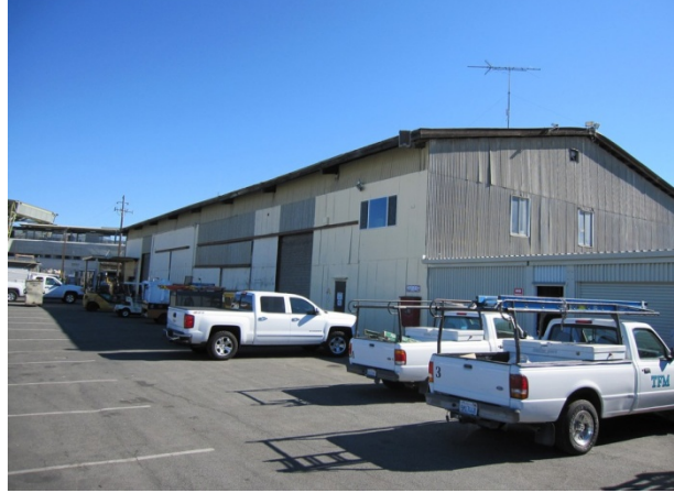
Photograph 3. View of main maintenance building.