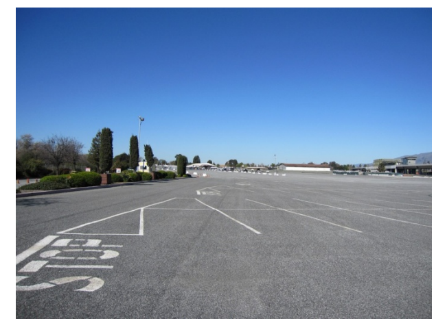
Photograph 16. Southern parking lot, looking north.

Photograph 15. Emergency generator near water supply well.