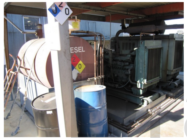
Photograph 5. Two emergency generators and associated diesel AST.