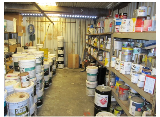
Photograph 9. Paint storage shed.