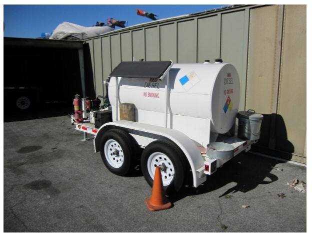
Photograph 8. Trailer mounted diesel AST.