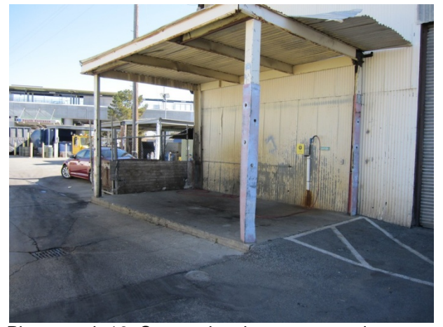
Photograph 13. Steam cleaning area at maintenance building.