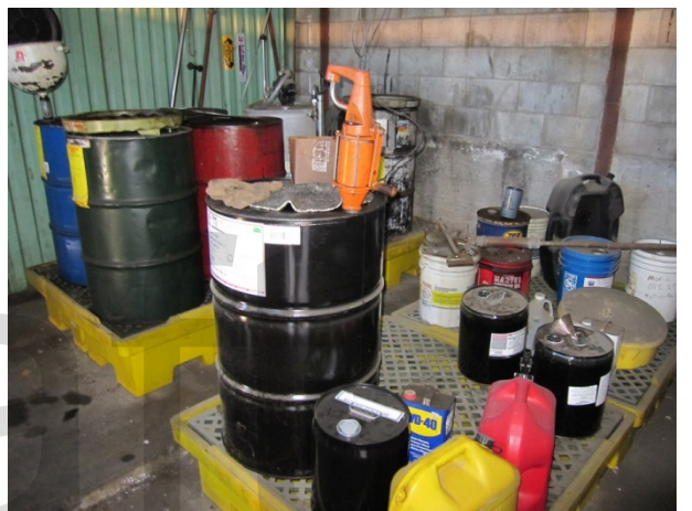
Photograph 6. Stored items in hazardous materials storage shed.