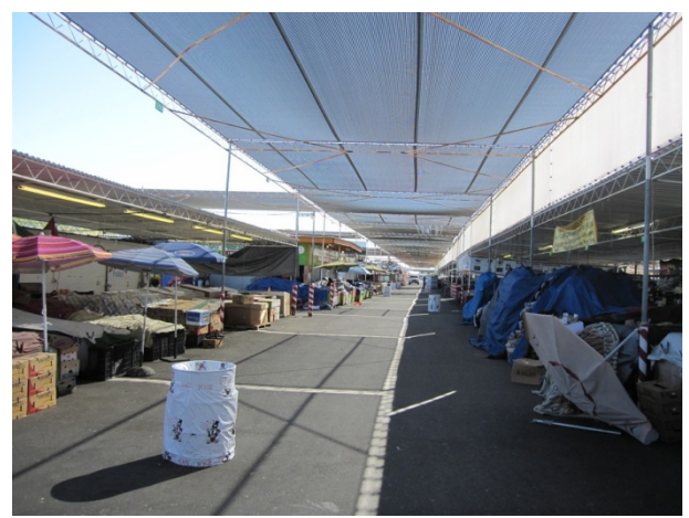
Photograph 1. View of merchandise sales area.