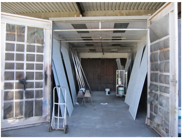
Photograph 10. Paint spray booth.