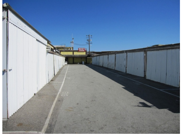
Photograph 2. View of merchandise sales area.

1590 Berryessa Road and 1411 Mabury Road, San Jose, California 118-98-1