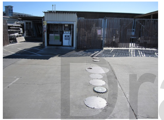
Photograph 11. Dual compartment UST, dispenser and adjacent oil and hydraulic fluid ASTs.