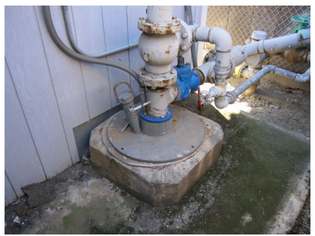
Photograph 14. Water supply well.