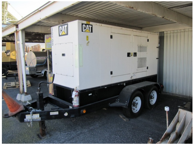
Photograph 7. One of several trailer mounted emergency generators.