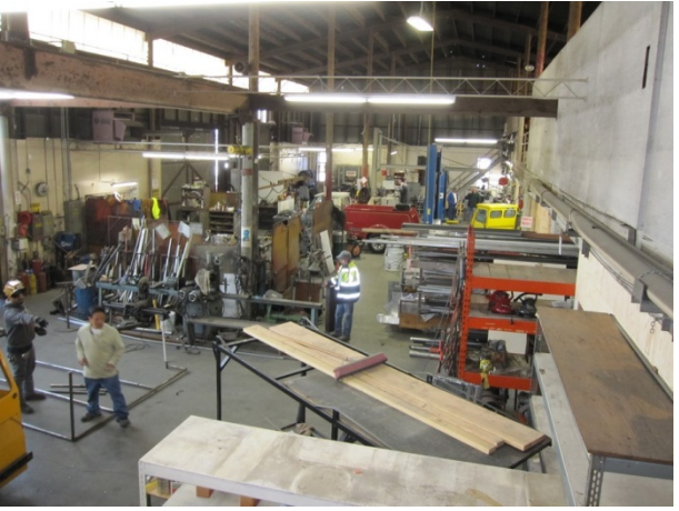
Photograph 4. Interior of maintenance building.