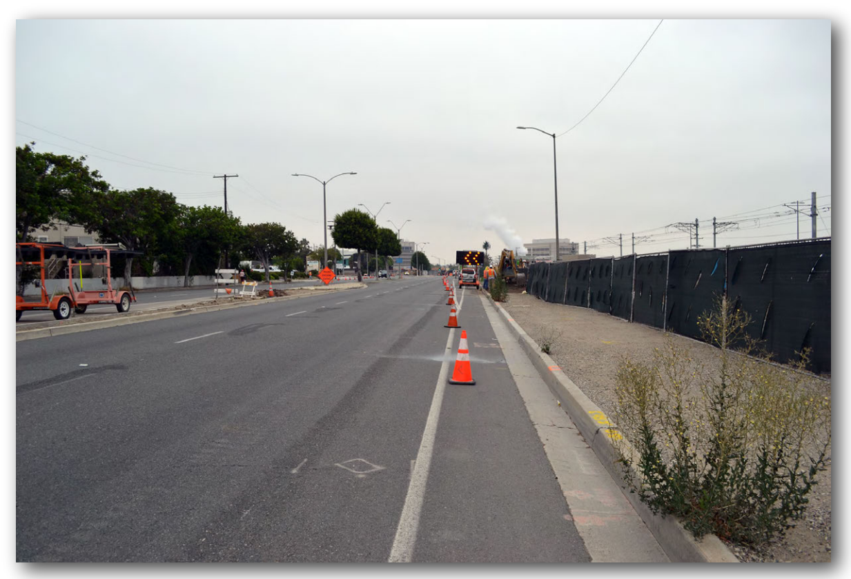
Conceptual View Without Project