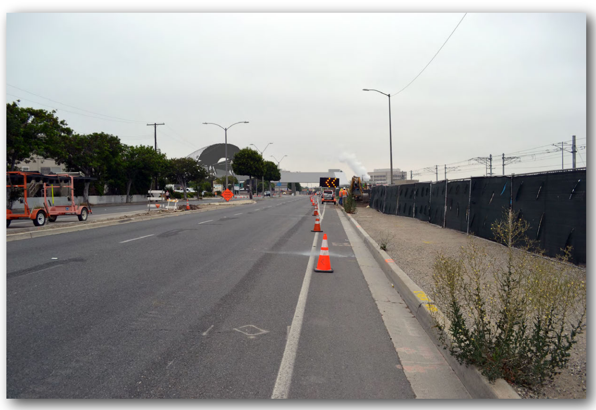
Conceptual View With Project