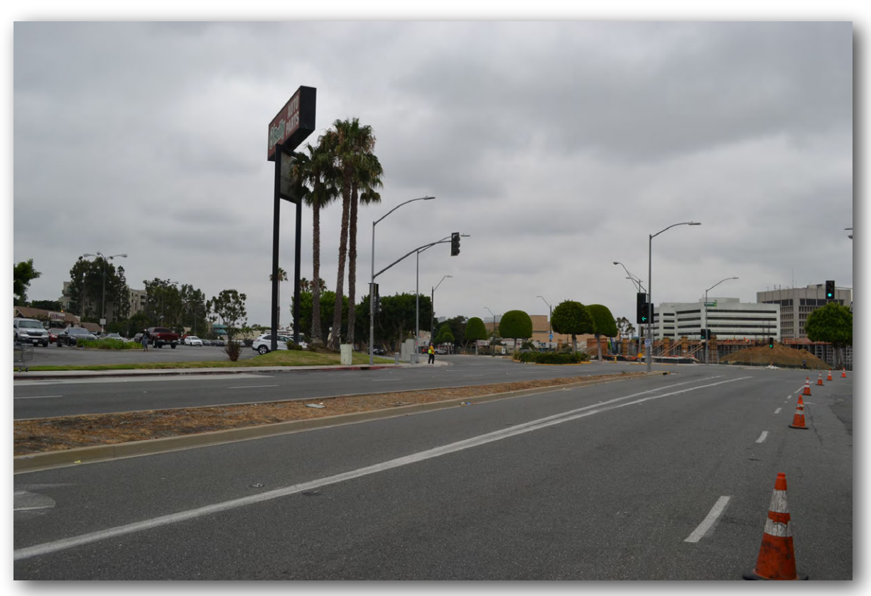
Conceptual View Without Project