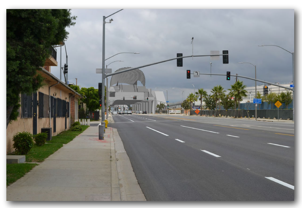
Conceptual View With Project