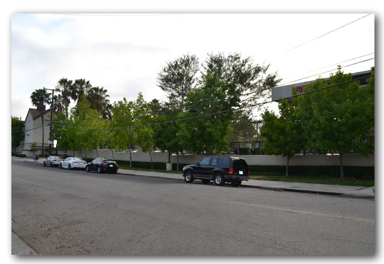
Conceptual View Without Project