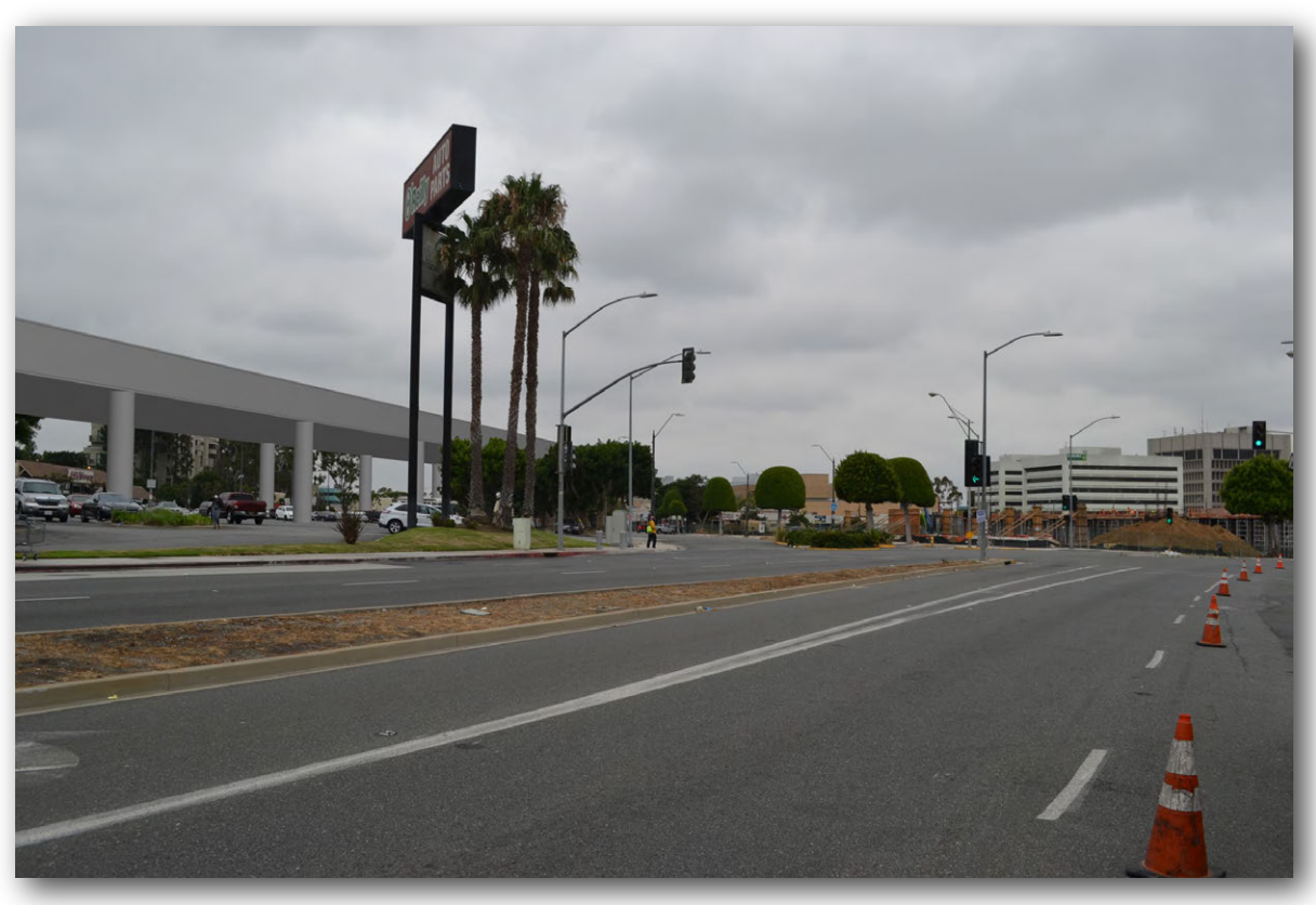
Conceptual View With Project