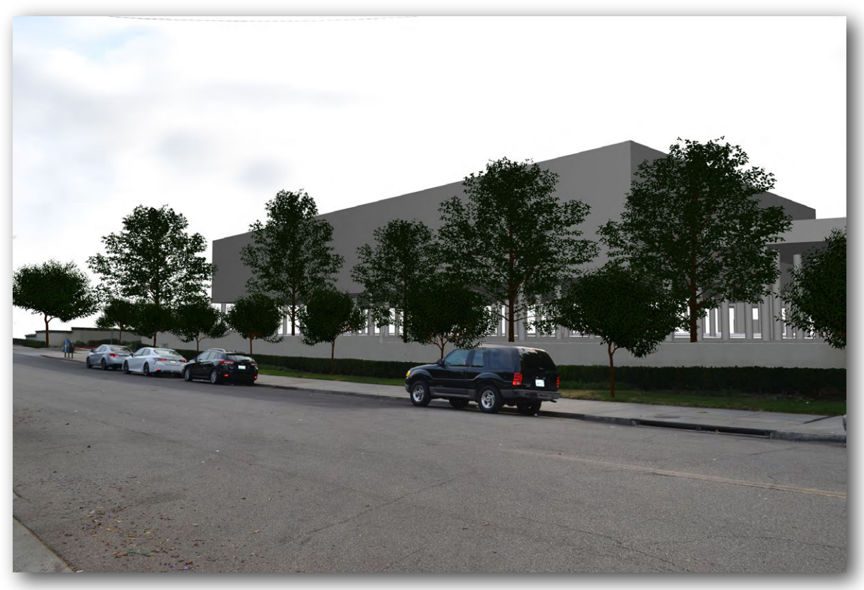
Conceptual View With Project