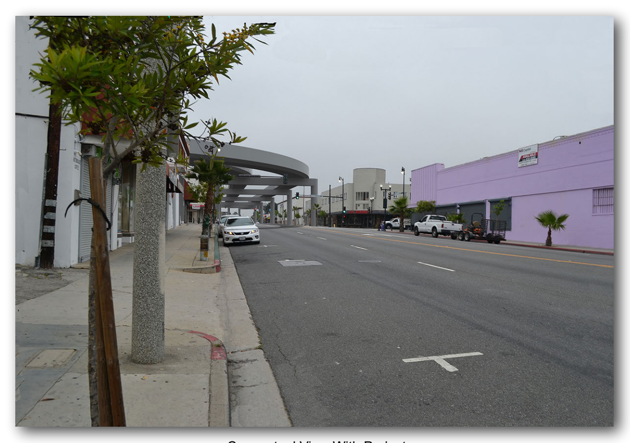
Conceptual View With Project