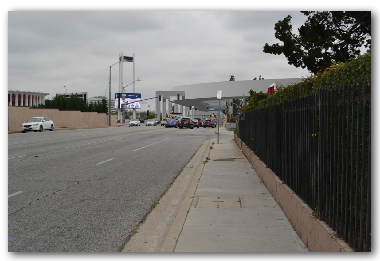
Conceptual View With Project