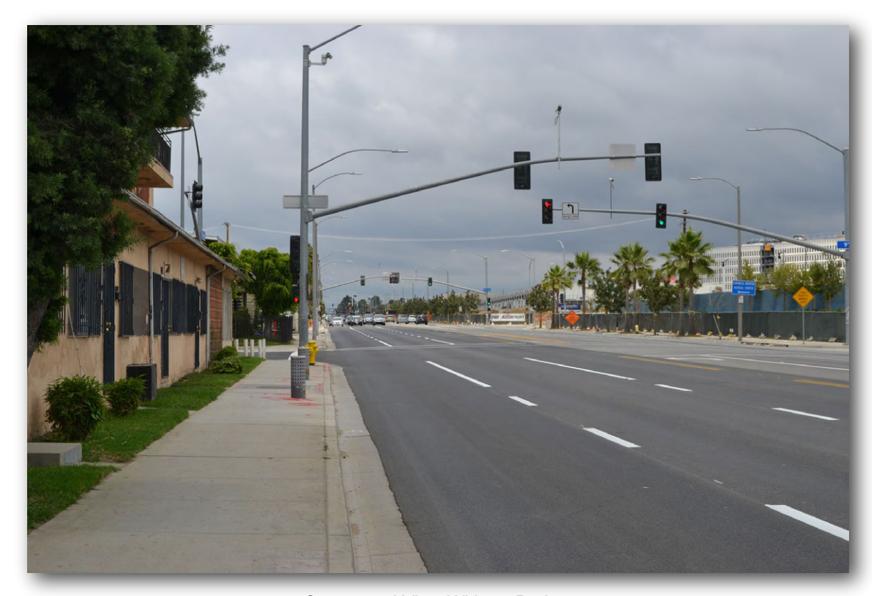
Conceptual View Without Project