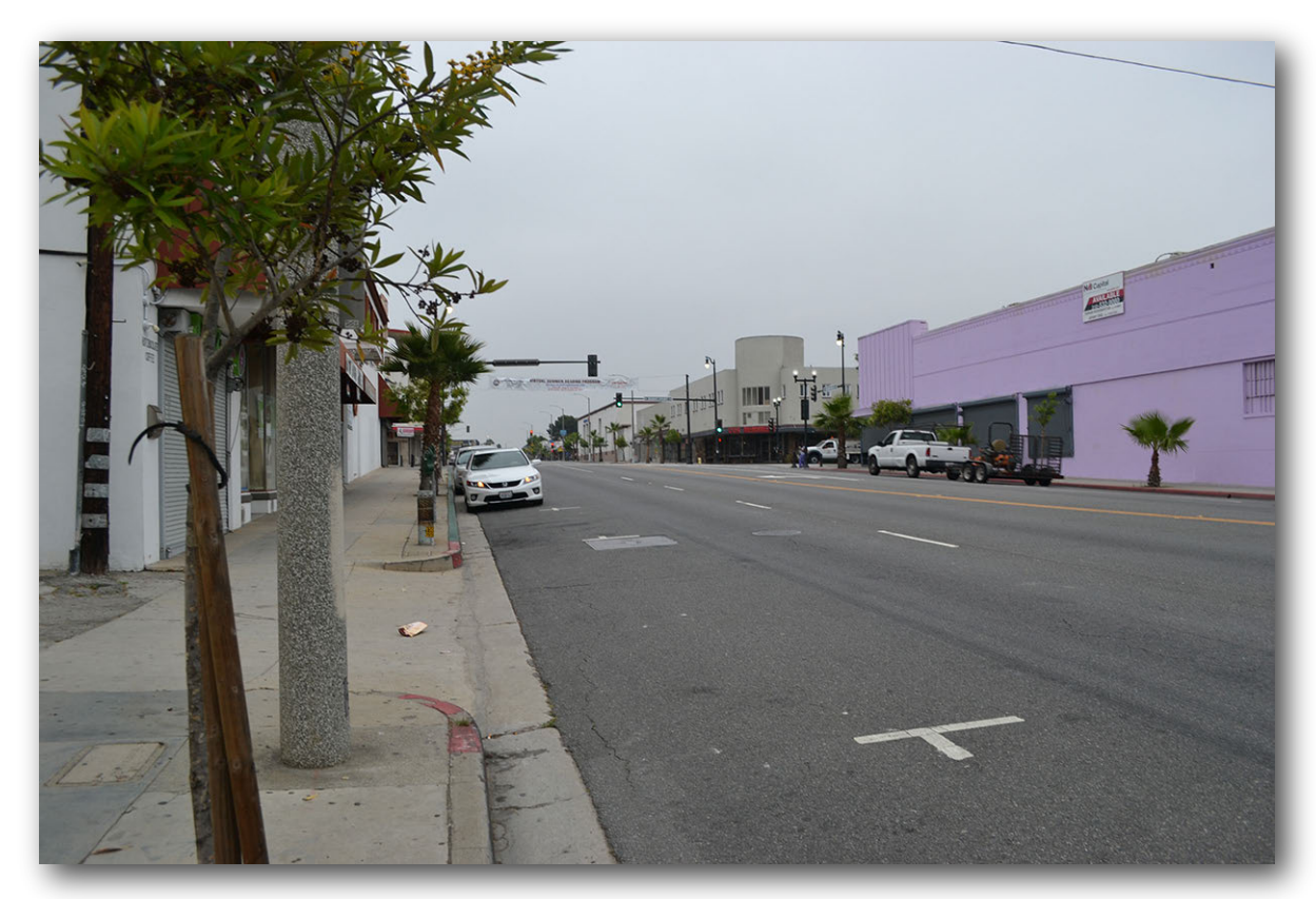
Conceptual View Without Project