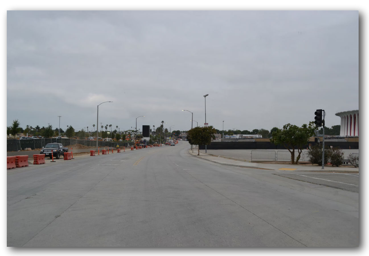
Conceptual View Without Project