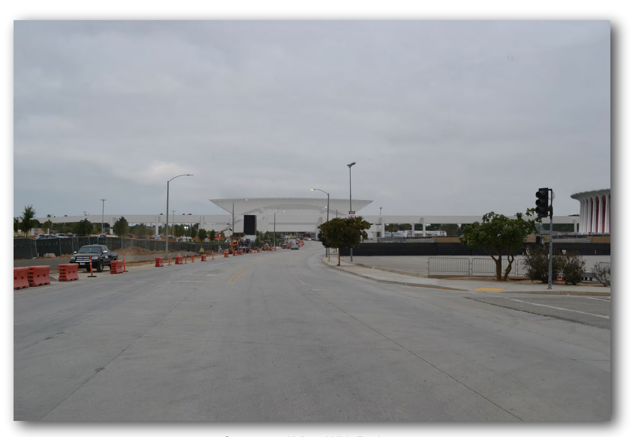
Conceptual View With Project