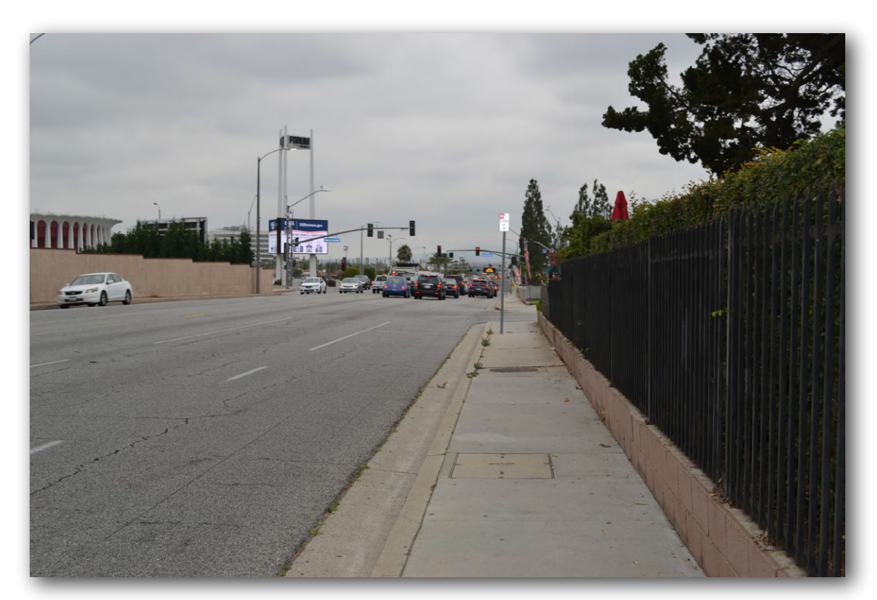
Conceptual View Without Project