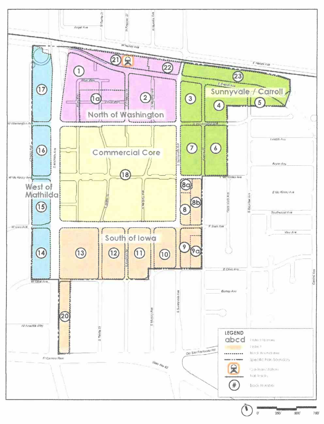
FIGURE 1-1 DOWNTOWN DISTRICTS