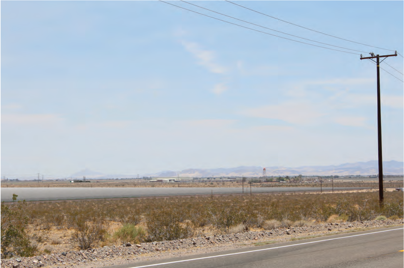
AFTER - Photo Simulation