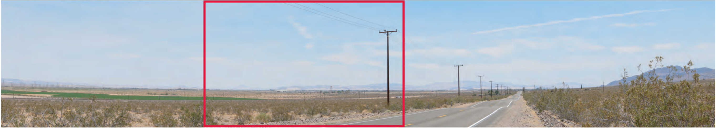
CONTEXT - Original Photo (above left) within Original Panoramic Context

Image Data Camera Model: Canon EOS Rebel T6 Camera Height: 68 inches Direction of View: East Distance to Project: 520 meters