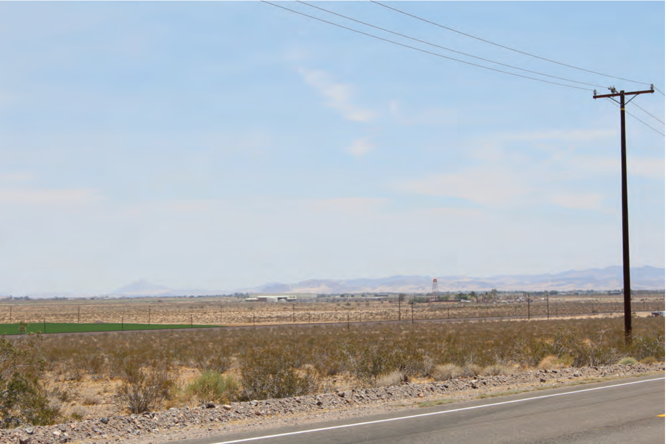
BEFORE - Original Photo