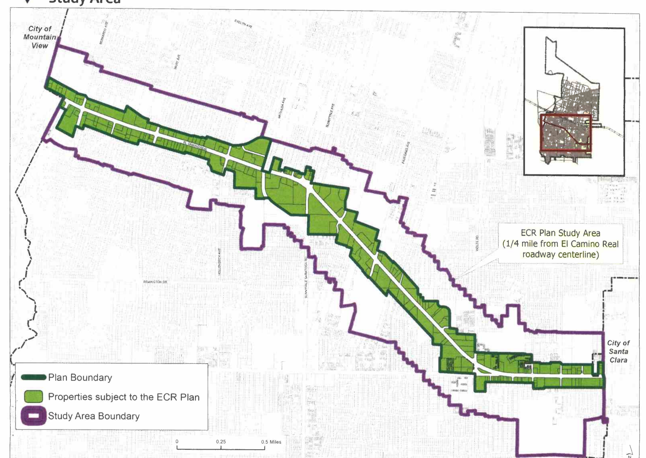
Exhibit A Page 1 of 1