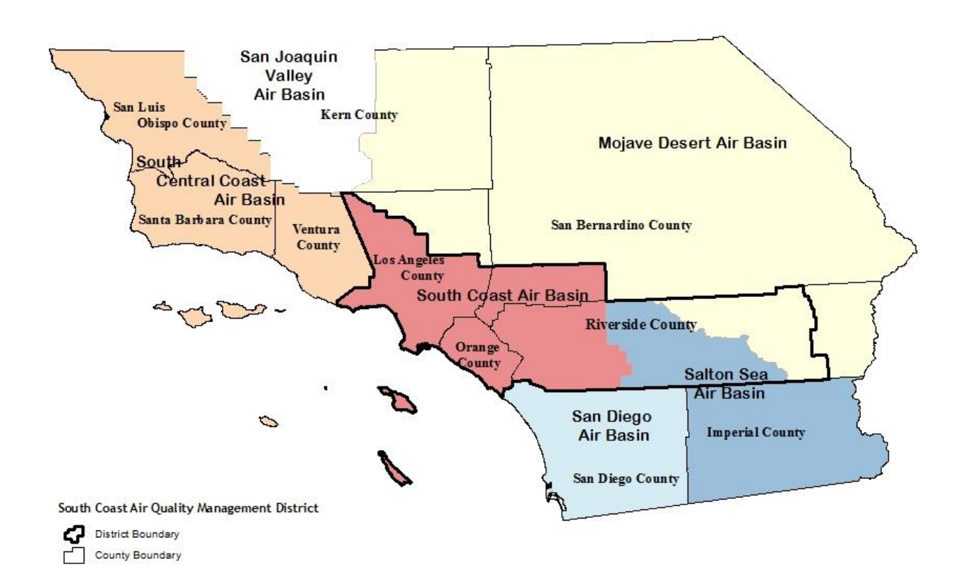
Figure 2-1 Southern California Air Basins and South Coast AQMD's Jurisdiction

The South Coast AQMD has jurisdiction over an area of approximately 10,743 square miles, consisting of the four-county South Coast Air Basin (Basin), the Riverside County portion of the Salton Sea Air Basin (SSAB) and the non-Palo Verde, Riverside County portion of the Mojave Desert Air Basin (MDAB). The Basin, a subarea of South Coast AQMD's jurisdiction, is bounded by the Pacific Ocean to the west, the San Gabriel, San Bernardino, and San Jacinto mountains to the north and east and includes all of Orange County and the non-desert portions of Los Angeles, Riverside, and San Bernardino counties. The Riverside County portion of the SSAB is bounded by the San Jacinto Mountains in the west and spans eastward up to the Palo Verde Valley. A federal non-attainment area (known as the Coachella Valley Planning Area) is a subregion of Riverside County and the SSAB that is bounded by the San Jacinto Mountains to the west and the eastern boundary of the Coachella Valley to the east (see Figure 2-1).