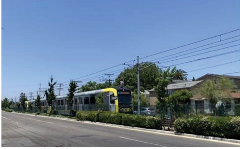
At-Grade LRT Guideway on the Metro E Line