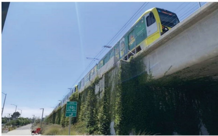
Aerial Guideway Transition to At-Grade Level over Retaining Wall on the Metro E Line