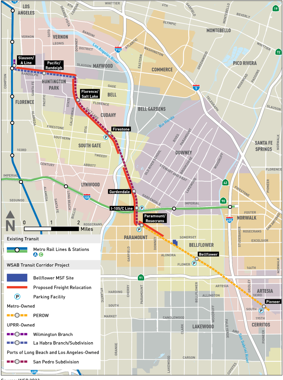
Figure 1-10. Existing Rail Right-of-Way Ownership