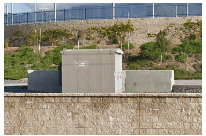
Figure 1-7. Example of Train Control House (Metro L [Gold] Line, Monrovia Station)

Train control houses containing signal equipment will be located periodically along the alignment within the ROW. Electric power switches, contained in metal box-like enclosures, will be required at ground level. These switches will transmit electric power from the Southern California Edison electric grid to the traction power and other rail systems. Figure 1-7 shows an example of a typical train control house.