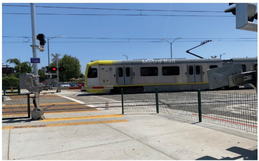
Pedestrian Gate Crossing Equipment on the Metro E Line