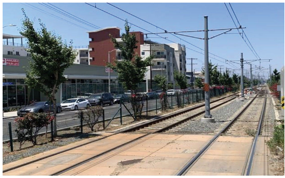
Figure 1-5. Example of Overhead Catenary System

The OCS electrically powers the LRT through a contact wire suspended above the track, as shown in Figure 1-5. The wires will be located approximately 20 feet above the track, supported by poles spaced at an average interval of 150 feet. The catenary poles generally will be located in the center of the project alignment or located on both sides of the tracks in some locations. Table 1.1 presents the estimated height of the OCS poles and other system components.