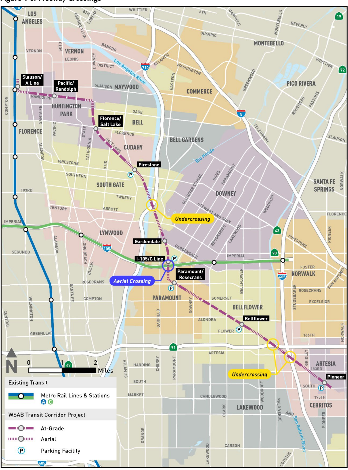
Figure 1-8. Freeway Crossings